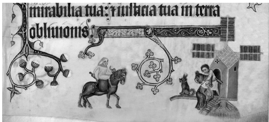
FIGURE 2: Pack horse or mill horse illustrated in the Luttrell Psalter (© The British Library Board Add. MS 42130, fo. 158)

large number of young horses often categorized them according to age, with animals born that year ( de exitu , literally 'of issue') distinguished from those in their second and third years. Horses above three years of age were usually graduated to one of the adult categories, such as affers, mares or carthorses. 22