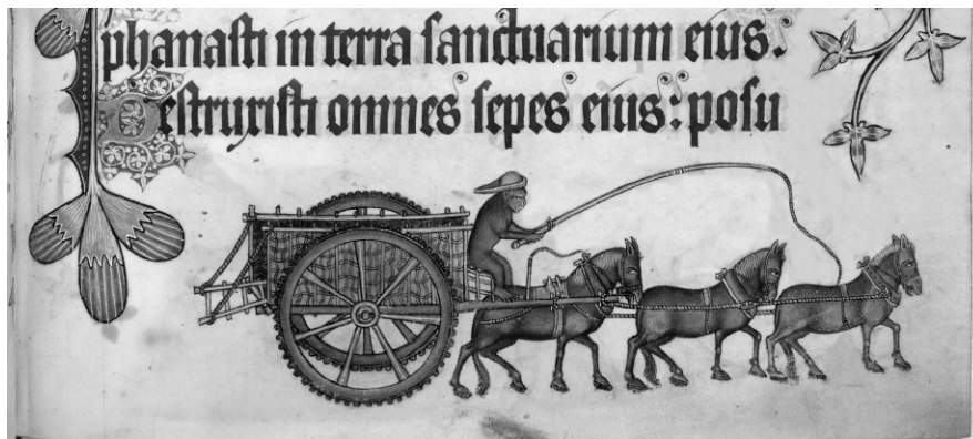
FIGURE 1: Cart horses illustrated in the Luttrell Psalter (© The British Library Board Add. MS 42130, fo. 162)