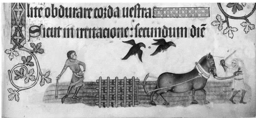
FIGURE 3: Luttrell Psalter harrowing scene (© The British Library Board Add. MS 42130, fo. 171)

manor's two horse-mills, 24 while another of the Bishop's manors kept a single mill-horse, but this beast was seemingly used as a pack animal working at the manor's water mill. 25 Figure 2, also from the Luttrell Psalter, depicts precisely this kind of work. Finally, there are very rare references to stallions ( stallones ). These animals are generally found only on manors engaged in the breeding of rounceys or other more elite horses, such as Isabella de Fortibus' stud farm at Holderness in Yorkshire, and are not a feature of the typical medieval English manor. A few accounts also list horses simply under the general term of ' equus ', but this seems to have been an institutional nomenclature used primarily by the monks of Westminster Abbey, 26 as of the 24 demesnes in our sample which record equi , 18 were manors of the abbey. These horses were also all-purpose animals similar to the affers and stotts. The equi found on the Kentish manor of West Cliffe were used for harrowing (an activity illustrated in Figure 3). The two equi on the Berkshire manor of Bray were put to 'diverse jobs of London'. 27