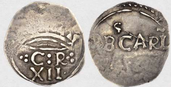
1645 Carlisle Besieged Shilling, (S.3139, N.2365). Bold good very fine: Hammer Price - £14,000