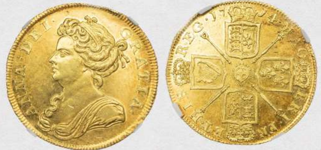
1714/3 Queen Anne Two Guineas, (S.3569). NGC AU58: Hammer Price - £17,000