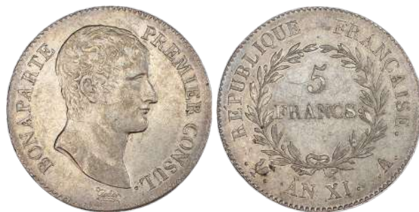
262. France, Consulate, Napoleon I (1799-1804), silver 5 Francs, year 11 – 1802-1803, A – Paris, 25.16g (Gad. 577). Very Fine. £300