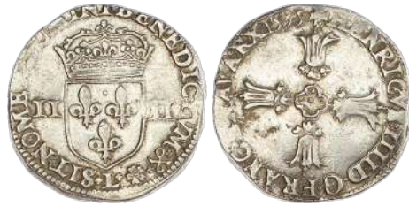
260. France, Henry IV (1589-1610), silver 1/4 Écu, 1595, L – Bayonne, 9.58g (Dy. 1224; L. 1066). Very Fine. £165