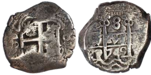
247. Bolivia (colonial), Ferdinand VI (1746-1759), silver Cob of 8 Reales, 1749, Potosi mint, 24.86g (S-P50a; KM 40; A&C 511var. – retrograde q). Very Fine . £400