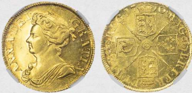
1710, Anne (1702-14), Guinea, (S.3574; EGC.474; MCE 222), NGC MS62. Hammer Price - £18,000