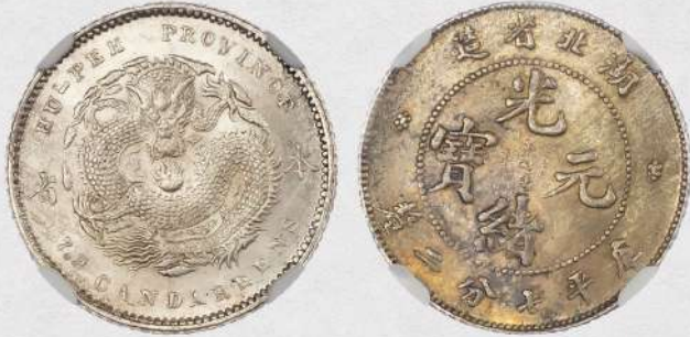
China, Hupeh, silver 10 Cents, 1895, Ben Shen variety – MS 65. Hammer Price - £65,000