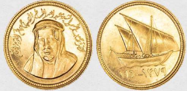
Kuwait, Abdullah Al-Salim Al-Sabah (1959-1965), gold Pattern 3 Dinars. Hammer Price - £23,000