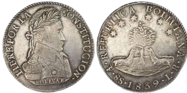
248. Bolivia , Republic, silver 8 Soles, 1839 LR, 27.05 g (KM 97). Very Fine . £150