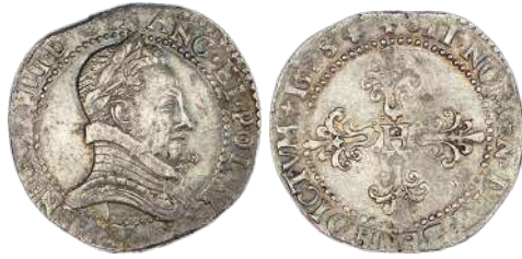
259. France, Henry III (1574-1589), silver Demi Franc, 1578, La Rochelle, 7.05g (Dy. 1131; L. 971). About Extremely Fine, lovely tone, some peripheral weakness, sharp portrait. £250