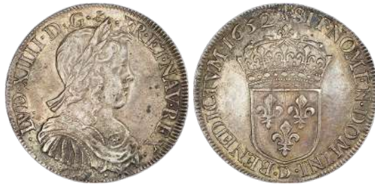
261. France, Louis XIV (1643-1715), silver Demi Écu à la mèche longue, 1652, D – Lyon, 13.58g (Dy. 1470). Good Very Fine. £250