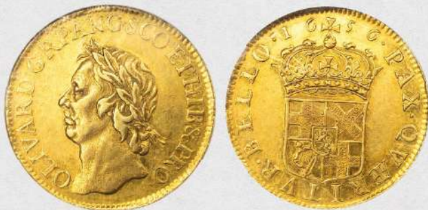
1656 Oliver Cromwell Broad, (S.3225, W&R.39). NGC AU55: Hammer Price - £16,000