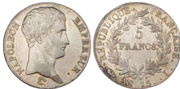
263. France, Empire, Napoleon I (1804-1814), silver 5 Francs, year 13 – 1804/1805, I – Limoges, 24.94g (Gad. 580; KM 662.7). Very Fine, minor dents to the edge. £300