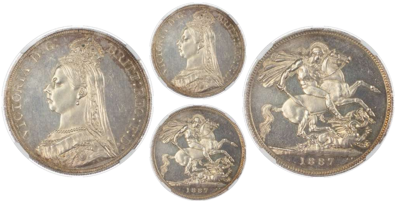
239. Victoria (1837-1901), Proof Crown, 1887, 'Jubilee' bust left, reverse St. George and the dragon (S.3921, Bull 3437, ESC 2097). About as struck some minor marks. Encapsulated by NGC as PF61. £1,650