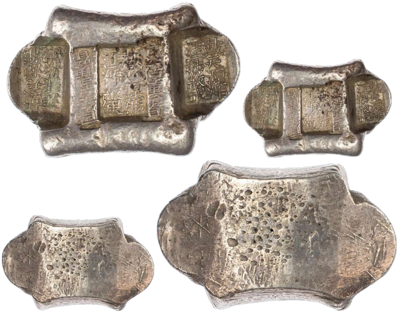
249. China, Yunnan , silver Sycee, 'packsaddle' type, no date, 19th – 20th century, Yunnan sanchuo jieding [three stamp remittance ingot], cast at Daitianyuan Bank, assayer marks F1 and F2, 200.59g (Cribb-Class-LXVI). Extremely Fine . £2,200