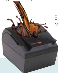
Spill Guard and MaxStick Options

CognitiveTPG's ReceiptWare marketing software turns every receipt into a promotional opportunity. Add logos and watermarks, offer promotions, highlight sales and savings, run contests, promote your Facebook page...the options are endless.