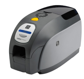
ZXP Series 3

From entry level to high performance printing, Zebra's product range can fulfill your needs for payment cards, food safety cards, driver's licences, membership cards, employee identification badges or gift cards to name a few.