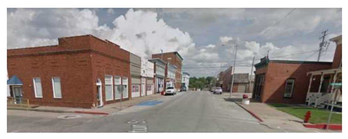
Intersection of Mortimer & Decatur Streets looking east