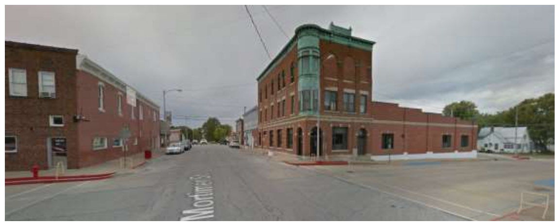
Intersection of Mortimer & Bainbridge Streets looking west