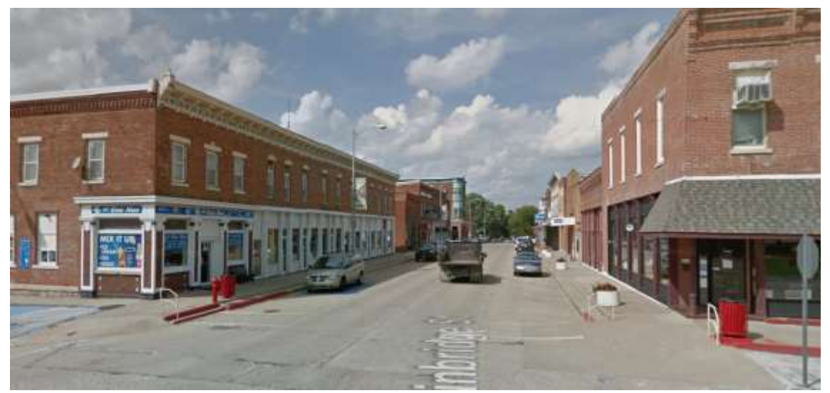
Corner of Bainbridge & Main Streets looking north