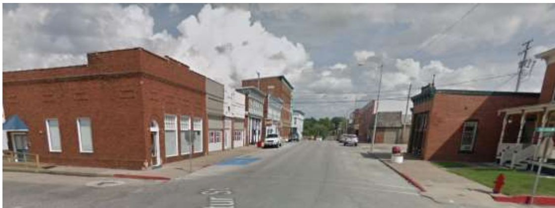
Intersection of Mortimer & Decatur Streets looking east