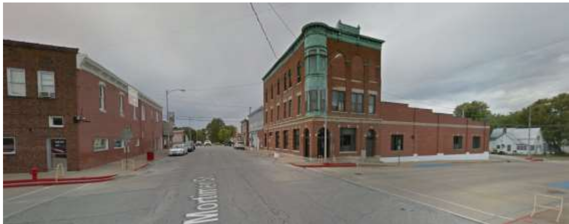
Intersection of Mortimer & Bainbridge Streets looking west