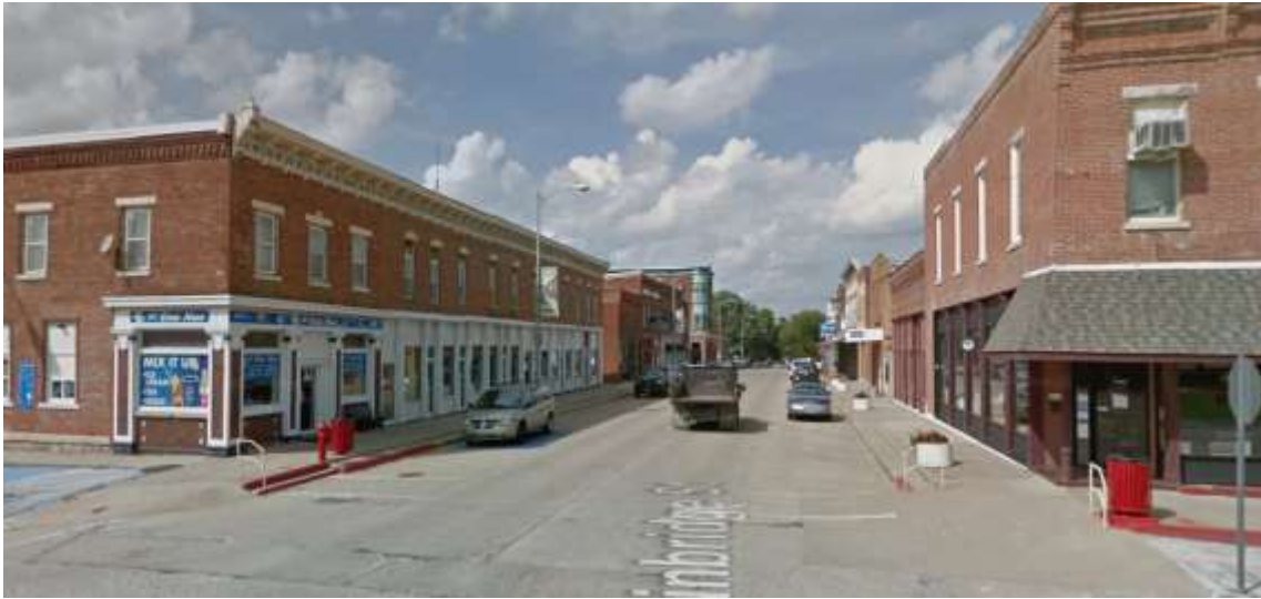
Corner of Bainbridge & Main Streets looking north