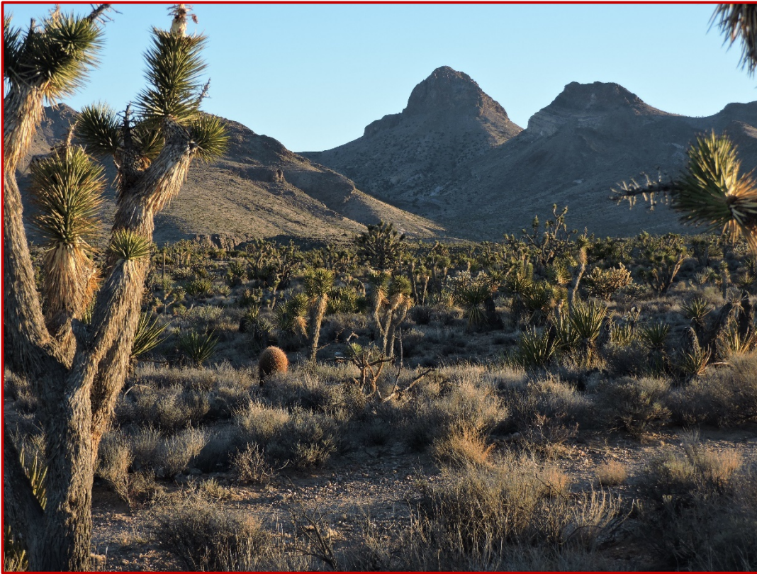
^ The Castle Mountains National Monument, California, seen from the proposed Nevada ACEC. This is one of the world's most extensive Joshua tree forests.