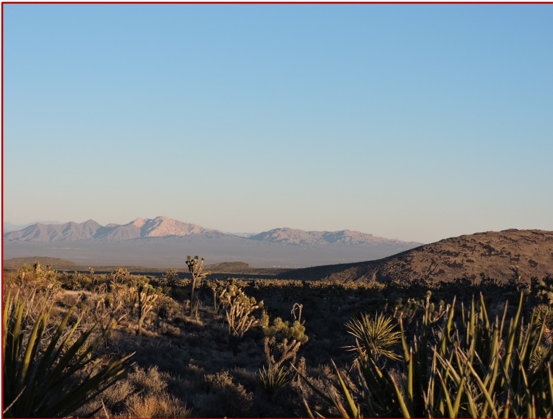
^Spirit Mountain seen from the proposed ACEC