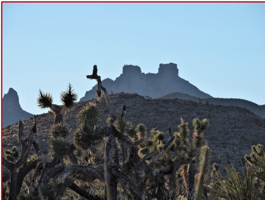
^The Castle Peaks, Mojave National Preserve seen from the proposed ACEC