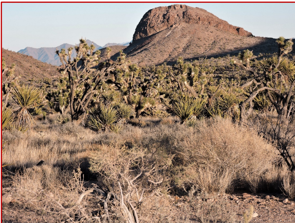
^Castle Mountains, Nevada