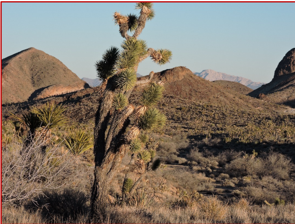
^Castle Mountains, Nevada, Looking East