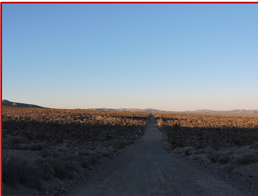
^The Hart Mine Road shows the undeveloped character of the region.