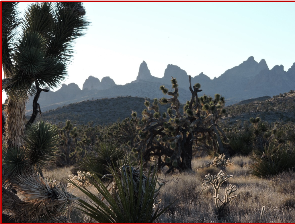
^The Castle Peaks in the Mojave National Preserve, California seen from the proposed Castle Mountains ACEC, Nevada. The unique grassland can also be seen in the photo.