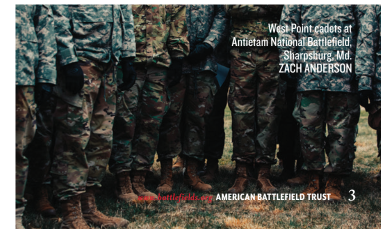
West Point cadets at Antietam National Battlefield, Sharpsburg, Md.

The Trust also continues to support young voices. The Trust's Youth Leadership Team welcomed its second cohort of young leaders to serve as the youth face and voice of the organization. Empowered by their enthusiasm for history and their newfound connections, members of this trailblazing group will work toward the creation of battlefield preservation, education or visitation projects in their local communities. Members of the inaugural cohort demonstrated just how compelling their voices can be: One member unveiled an ambitious audio drama to bring new life to the Revolutionary War's Battle of Kings Mountain, while another penned and published an opinion piece exposing the formative history tied to a battlefield in his "backyard" — at which the Trust endeavors to save land. By supporting this group, we create a ripple effect, fostering the next generation of preservation advocates that will tend to the places that make up our American story. ★