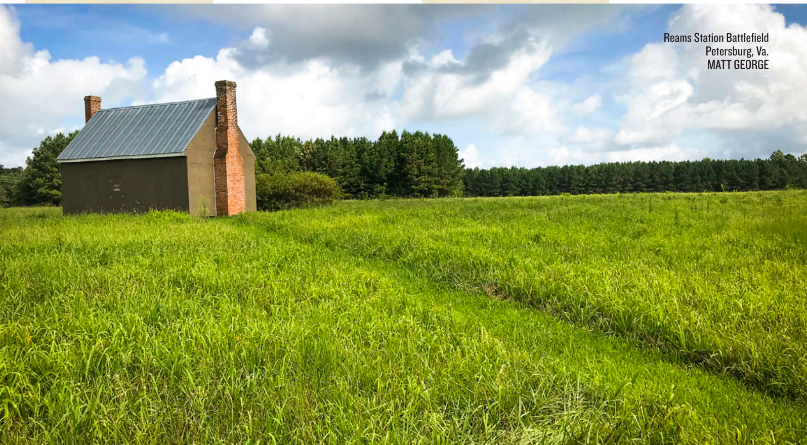
Reams Station Battlefield Petersburg, Va.