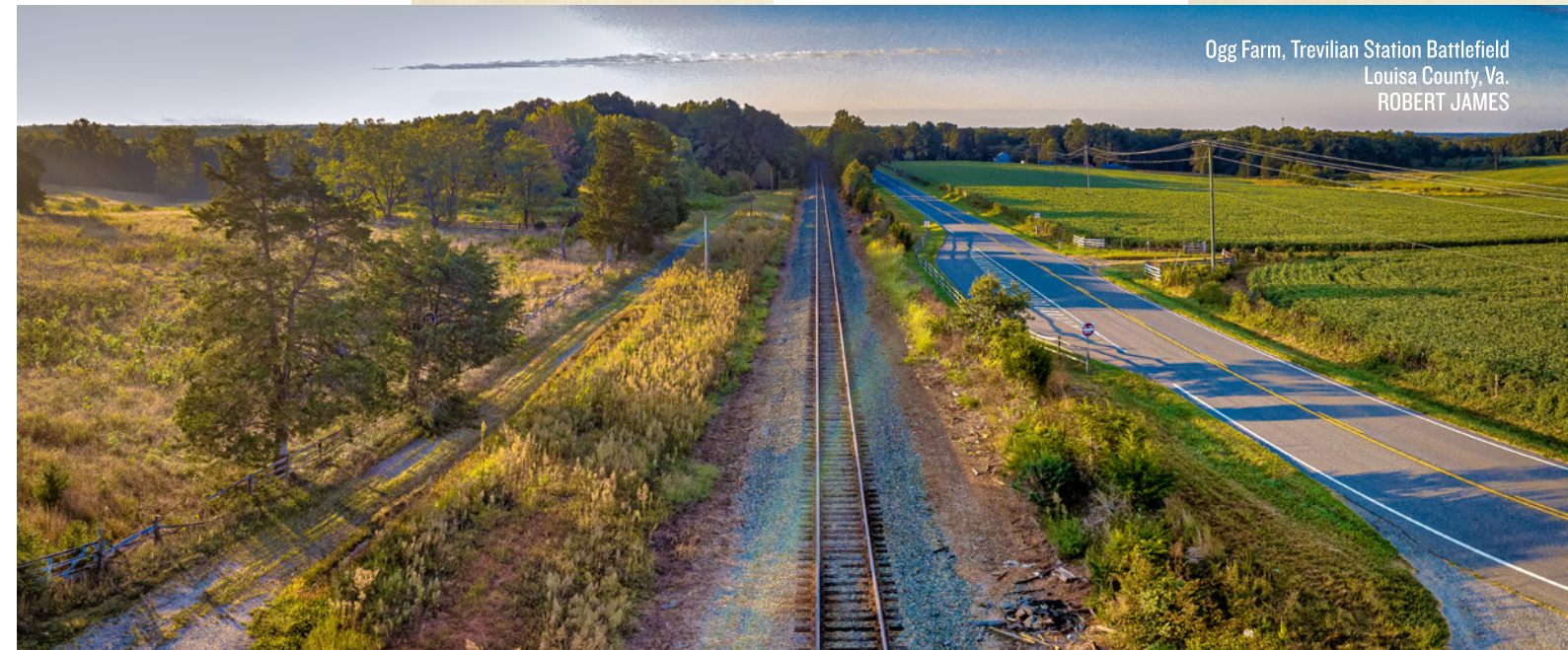
Ogg Farm, Trevilian Station Battlefield Louisa County, Va.