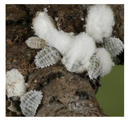
Adult apple mealybugs.

All three causes are transmitted by all types of grafting, including top-working and root-grafting between neighboring trees