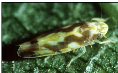
Left: Adult Virginia creeper leafhopper (VCL)