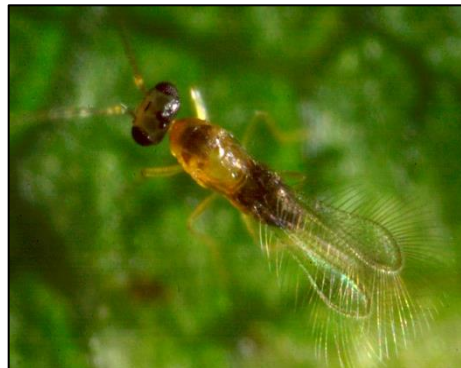
Anagrus wasps parasitize leafhopper eggs.

Yellow sticky tape strung below the vine cordon used by some producers of organic grapes is applied just before bud break . Applying, removing and recycling the tape is difficult and time consuming, and this practice is best used for edge rows and small areas with very high overwintering populations. From late petal fall to around mid-July marks the time period when additional actions can be taken to control 1 st generation leafhoppers: those being early season removal of basal leaves, sprays of materials deterrent to leafhoppers, and applications of oils or insecticides. Although varying from year to year, a rough date for the start of these control actions at SuRDC is around the 3 rd week of June . Spring is a good time to consider planting hardy shrub and bush roses, thorn-less blackberry, ornamental or commercial Prunus , and other members of the Rosaceae plant family that serve as winter hosts for tiny Anagrus erythroneuræ wasps that can parasitize large numbers of WGL eggs.