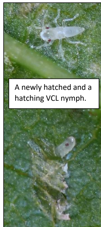
A newly hatched and a hatching VCL nymph.

3) Oil sprays. PureSpray Green Spray Oil ® has been shown to be more effective than Vegol ® or soap against leafhopper nymphs, but it is not yet registered for the control of leafhoppers on grapes in Canada. However, sprays of PureSpray Green applied to control mites, or Vegol applied for other