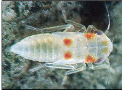
Partly grown VCL nymph, left, and WGL nymph, right.