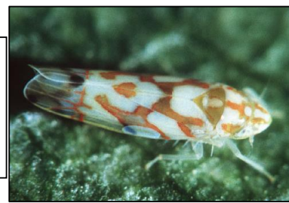
Right: Adult western grape leafhopper (WGL)

The Virginia creeper leafhopper (VCL), Erythroneura ziczac , and the western grape leafhopper (WGL), E. elegantula , both overwinter as adults. In early spring they feed on a range of plant species before moving to feed on grapevines when the first leaves are available. Eggs of the 1 st generation deposited by the overwintered females during May and June are confined largely to a zone from the 2 nd leaf to just above the 2 nd fruit cluster. Eggs are not deposited into a leaf until the leaf is fully expanded and with enough waxy cuticle to support the developing egg.