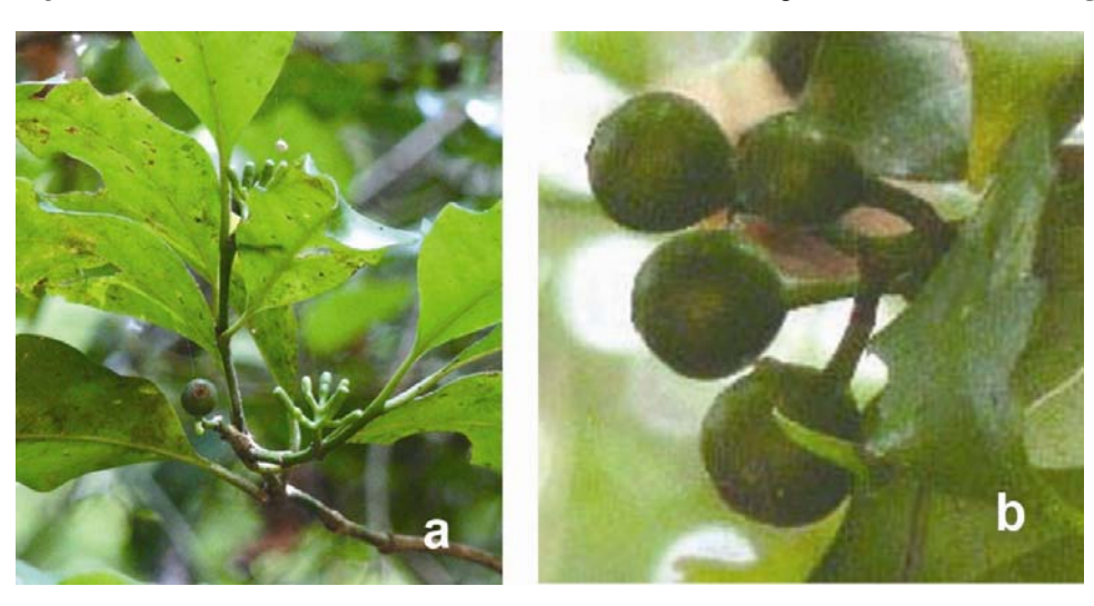
Fig. 4. Oxyceros rugulosus (Thw.) Tirveng. (a) habit and (b) fruits.

4. Oxyceros rugulosus (Thw.) Tirveng. in Nordic Jour. Bot. 3(4): 466 (1983). Griffithia rugulosa Thw., Enum. Pl. Zeyl. 159 (1859). Randia rugulosa (Thw.) Bedd., For. Man. Bot. 133 (1871); Hook.f., Fl. Brit. Ind. 3: 113 (1880); Trimen, Handb. Fl. Ceylon 2: 331 (1894). Aidia rugulosa (Thw.) Tirveng., Ceylon Jour. Biol. Sci. 14: 3 (1981). Aidia rugulosa (Thw.) Swamin. in Biol. Mem. 2 (1-2): 67 (1977). Bangla name: Kutmal ( Fig. 4 )