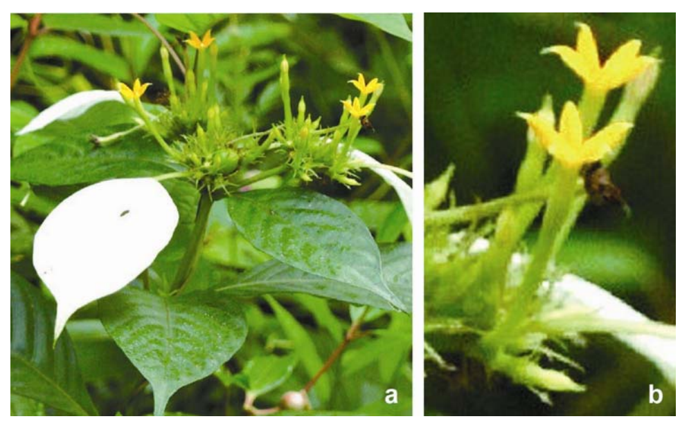
Fig. 2. Mussaenda incana Wall. (a) habit, (b) enlarged flowers.

An erect undershrub, densely clothed with adpressed and spreading hairs, up to 1 m tall. Stipules triangular, up to 8 mm long. Petioles up to 7 mm long. Leaves sub-sessile, usually elliptic, ovate or oblong, lamina 5 - 20 \times 2 - 10 cm, apex acuminate, base acute, sub-coriaceous, thinly pilose above, densely and softly pilose beneath, veins more densely hairy. Inflorescence a clearly 2 - 3 branched terminal corymb, laterals overtopping to central branch, usually dense on each branch, comparatively few-flowered; calyx lobes filiform, tapering from base, up to 6 mm long, pilose with long silky hairs; corolla tube up to 2 cm long, adpressed pilose, lobes ovate, acute or acuminate. Berry globose, 10 - 13 mm long, pilose, eventually glabrescent, calyx persistent. Flowering and fruiting: May to August.