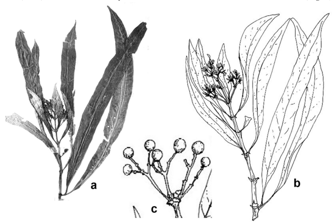
Fig. 5. Tarenna helferi (Hook.f.) Balakr. (a) habit, (b) habit sketch with flowers and (c) fruits.

5. Tarenna helferi (Kurz) N.P. Balakr. in Bull. Bot. Surv. India 22(1-4): 175 (1982). Webera helferi Hook.f., Fl. Brit. Ind. 3: 107 (1880). Ixora helferi Kurz in Jour. Asiat. Soc. 2: 316 (1872). Marma name: Rachi pouchi . ( Fig. 5 )