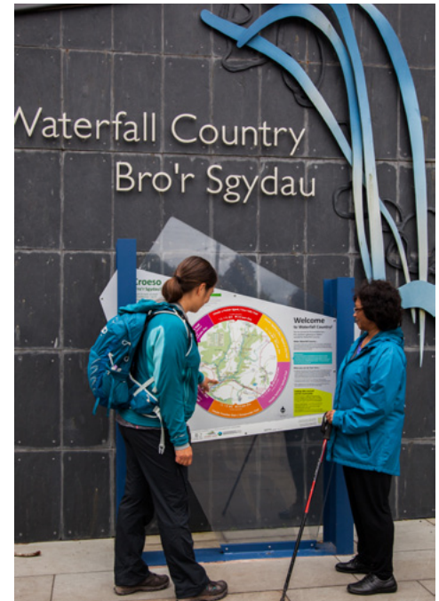
The new panel outside the public toilets, Pontneddfechan

Other improvements include painting the wording on the entrance gates to the Elidir trail as well as information promoting the audio trail and introducing the legend of Elidir and Gwladus.