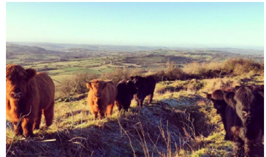
Highland cattle, hard at work!

This large fort located on a ridge top between Talybont and Llangorse in the Usk Valley, is thought to date from the Iron Age period (c. 800 BC - AD 74). The site has never been subject to archaeological excavation, but study of the earthwork ramparts suggests that it may have had a long period of use and was potentially refortified several times. As well as being highly defensible, the site would have been a great symbol of power. Remote sensing technologies are helping us appreciate the complexity of these earthwork boundaries.