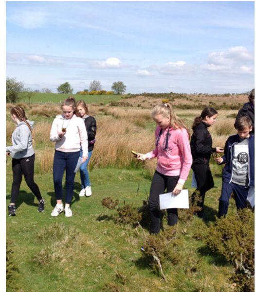
Geocaching on Mynydd Illtud

For further information on this and other courses see http://www.beacons-npa.gov.uk/learning/ or ring the Education team on 01874 624437