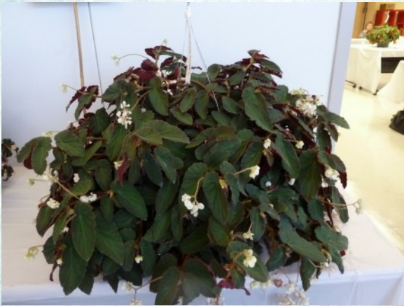
B. 'Brazilian Lady' (aka B. 'Withalacoochee')