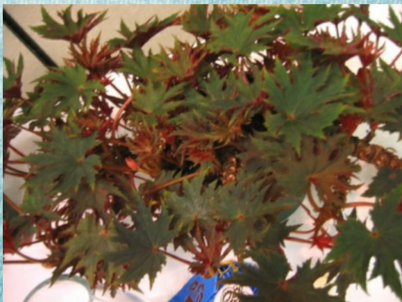
B. 'Carmel Browne'