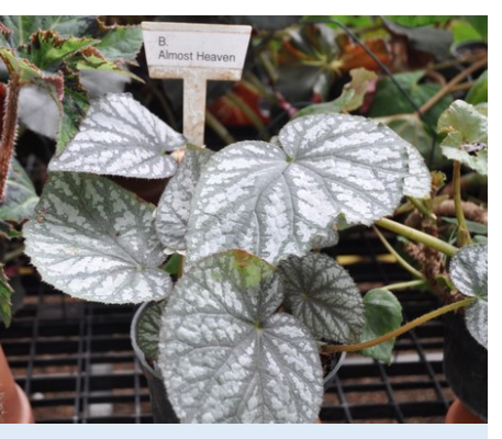
Photo of B. 'Almost Heaven' by Ross Bolwell, Fort Worth Botanic Garden, Sept. 2019