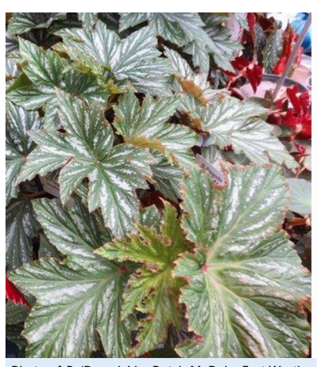
Photo of B. 'Pagoda' by Butch McDole, Fort Worth Botanic Garden. Both images from <u>The</u> <u>International Database of the Begoniaceae</u>.