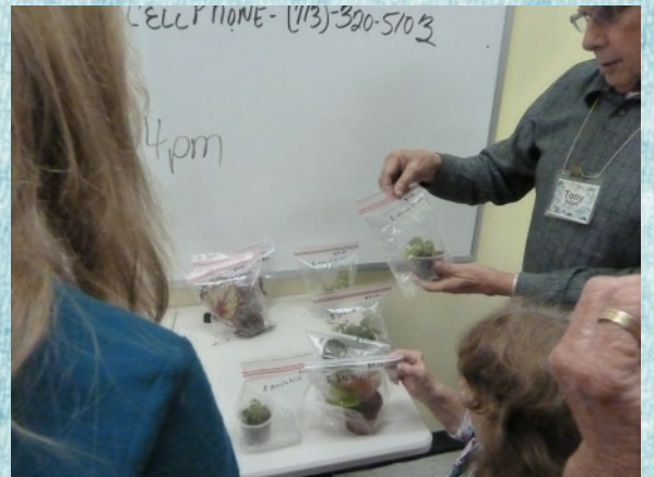
Less frantic shopping.