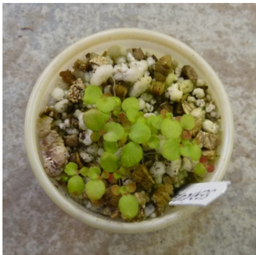
( B. sericoneura seedlings as of Saturday, November 23, 2019)

On Sunday, October 6, 2019 the monthly meeting of the Astro Branch of the American Begonia Society's program was dedicated to teaching Astro Branch members how to harvest and process Begonia seed. They were also walked through the planting of the seed once it is processed and deemed viable. The seed from B. sericoneura was used. All members present participated in planting the seed of B. seuriconeura in 1 oz condiment cups with holes punched in the bottom for drainage. The medium used was 50% perlite and 50% vermiculite. The seed was scattered on the top of the medium, then the planted condiment cups was placed in to a tray holding distilled water so the medium could draw up the water to completely moisten the medium. The planted condiment cups were then placed in a clear container with a clear lid to begin the germinating process in the member's home environment. Tom Keepin was instructing so his seeds were planted at a later date that as on Wednesday, October 13, 2019 at his home and placed under lights in his home office.....germination was noted on October 23, 2019. It is now November 22, 2019 and it is estimated that full germination has been achieved at about 75% of the seeds planted.