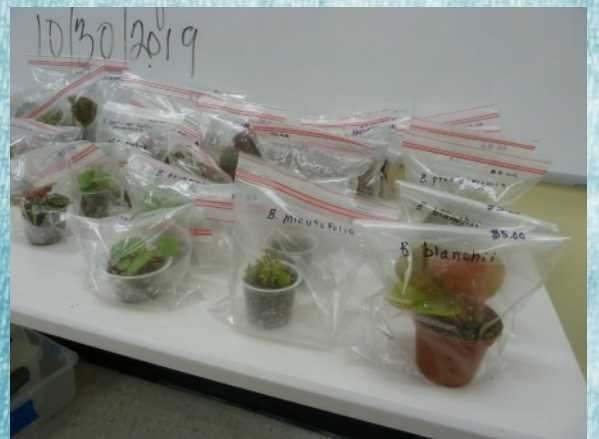
Plants for sale.