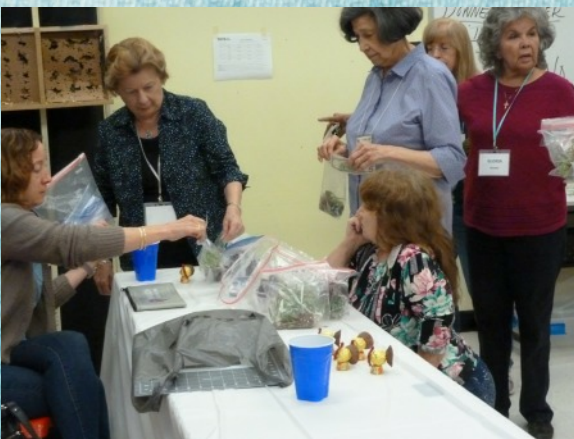
Paying for their new treasures.