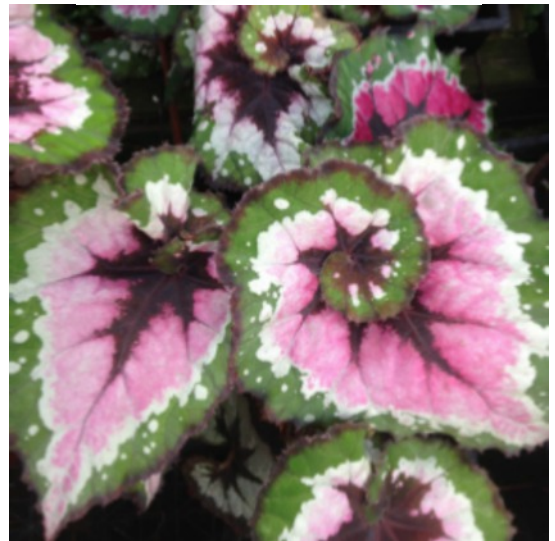
B. 'Curly Merry Christmas'