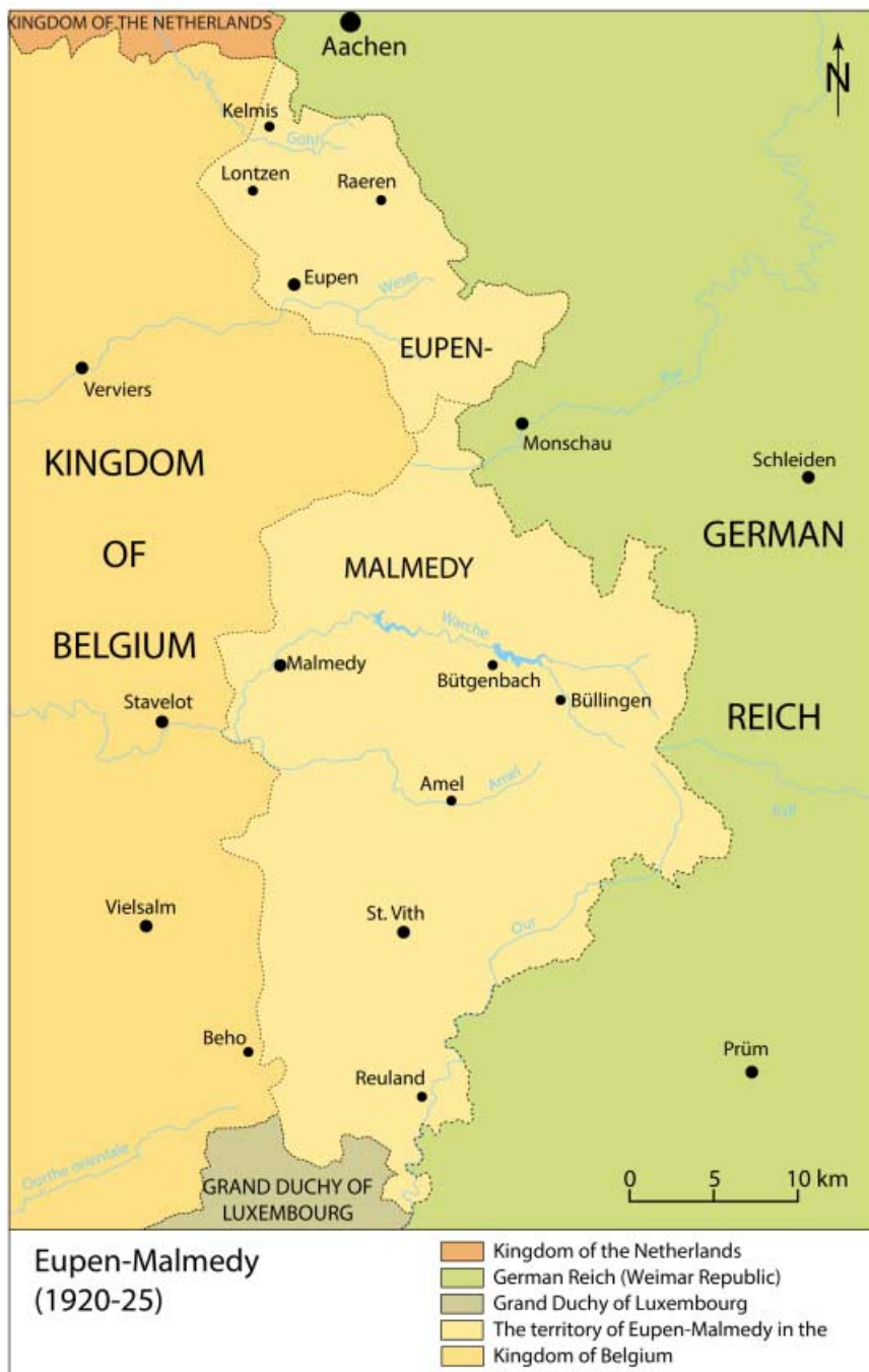
The regions of Eupen, Sankt Vith and Malmedy after the Treaty of Versailles (1920).