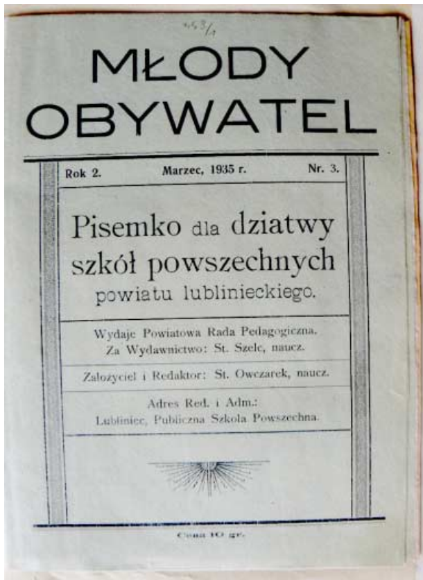
FIGURE 5.1. The school journal The Young Citizen , produced by the bilingual primary school in Lubliniec, was printed only in Polish. Młody Obywatel , 1935, vol. 2, 3, front cover.

The school journal ran for only a year and a half. Many causes can be given for its failure. Owczarek appeared unable to resolve the question of linguistic diversity. 130 Printed only in Polish, The Young Citizen failed to appeal to the pupils attending the German-speaking branch within the same school. In all the volumes of the school journal that remain, the latter did not feature once. Stanisław Owczarek also visibly struggled with the regionalism even Voivode Michał Grażynski had come to stand for.