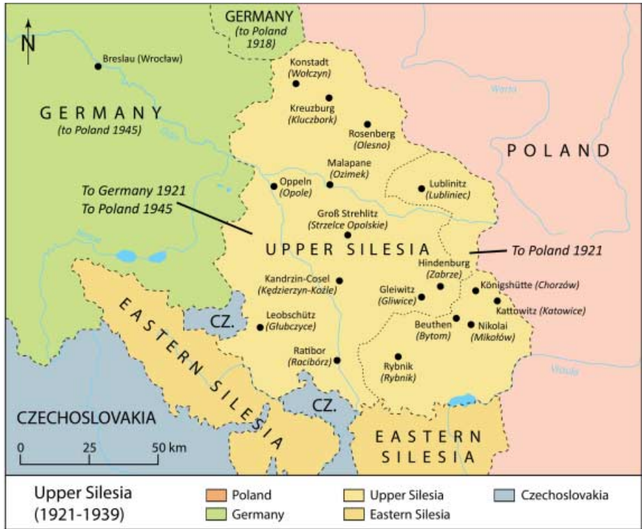
Upper Silesia (1921–39).