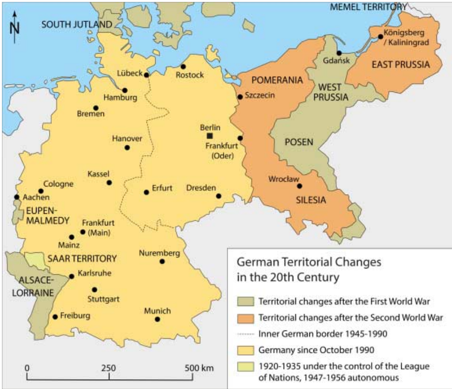
German Territorial Changes in the Twentieth Century.