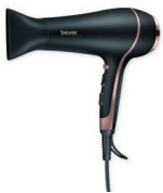
HC 30 Particularly powerful

The HC 30 has a power output of 2400 watts and dries thick hair particularly quickly. If you prefer ECO technology instead, look no further than the HC 60 . With energy consumption of just 1400 watts, it delivers full power (2000 watts) while saving energy.