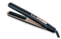
HS 100 Ready to use in just 12 seconds