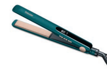
HS 50 Ocean