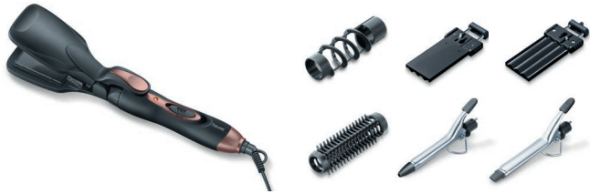
HT 60 With 7 interchangeable attachments

Need smooth hair for your morning meetings but also extravagant curls for the perfect evening look? Multi-functional stylers are versatile enough to make that wish come true. 7 interchangeable attachments make it easy to create virtually any look – with just one device.