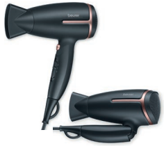
HC 25 With fold-in handle