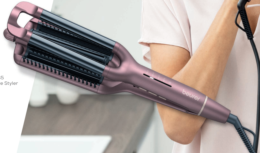
HT 65 Wave Styler