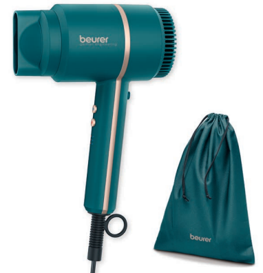
HC 35 Ocean Compact design