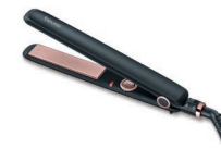
HS 30 With variable temperature settings