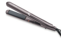
HS 15 With variable temperature settings

Hair straighteners elegantly shape unruly or frizzy hair, and Beurer's products make this simpler than ever thanks to their titanium, tourmaline, keratin or ceramic coating. Hair straighteners with a fast heating function are ready to use immediately, and variable temperature settings allow you to individually adjust the heat to suit your hair type.