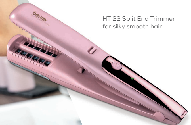
HT 22 Split End Trimmer for silky smooth hair