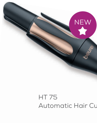
HT 75 Automatic Hair Curler

You don't have to be a professional to enjoy beautiful curly hair! The rotating HT 75 Automatic Hair Curler curls your hair with minimal effort, section by section.