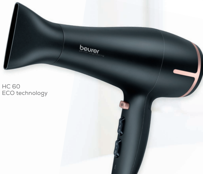
HC 60 ECO technology