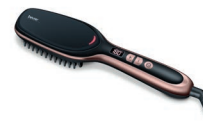
HS 60 With ion function and ceramic coating