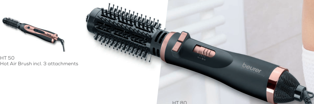
HT 50 Hot Air Brush incl. 3 attachments

The HT 50 and HT 80 Hot Air Brushes dry and style your hair at the same time. Unruly strands or natural curls are tamed, with various attachments adding volume from the roots.