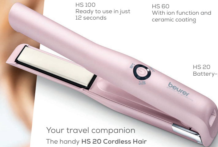
HS 20 Battery-powered and cordless

Thanks to the HS 60 Hair Straightening Brush , you can achieve great-looking straight hair with just one brush stroke.