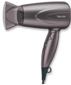
HC 17 With fold-in handle