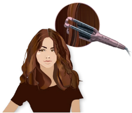
Natural waves & mermaid waves