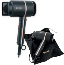
HC 35 Compact design