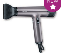
HC 100 Excellence