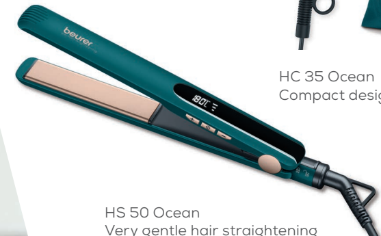
HS 50 Ocean Very gentle hair straightening