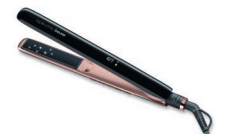
HS 80 With Triple Ionic Function