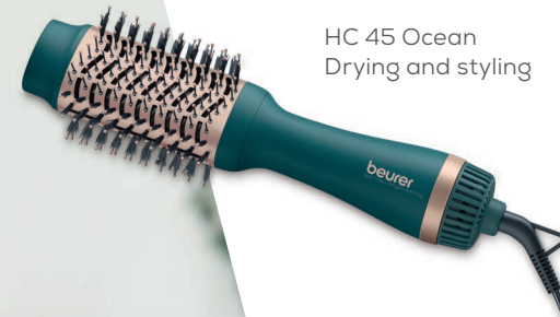
HC 45 Ocean Drying and styling

The range includes a hair dryer, volumising hair dryer brush and hair straightener, all in a trendy turquoise shade. It's a highlight for anyone who loves modern, elegant design – and makes it even more fun to create soft waves and sophisticated looks.