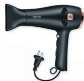
HC 55 With ion function