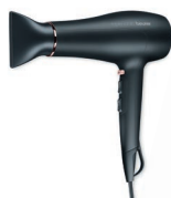
HC 50 With Triple Ionic Function

No more bad hair days! Hair dryers with an ion function are a real insider tip to perfect your hair care routine. They leave your hair sleek and shiny and stop flyaways and frizz. The Triple Ionic Function provides the ion technology in 3 stages – for every hair type and gentle styling.