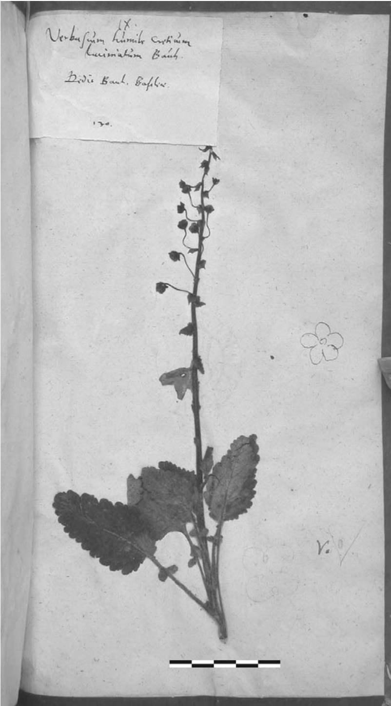
Fig. 3. Lectotype of Verbascum arcturus L. – Herb. Burser XIII: 130 (UPS). – Scale bar: 5 cm.