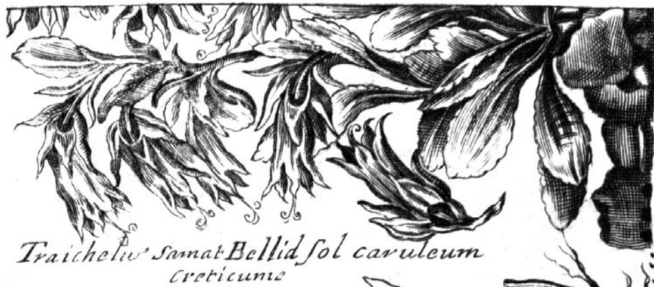
Fig. 1. Lectotype of Campanula saxatilis L. – Boccone, Mus. Piante : ad t. 64. 1697.