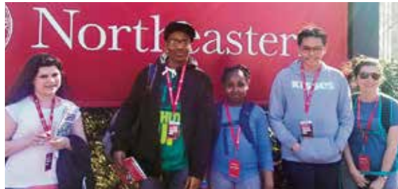
Teen members visit Northeastern University for a campus tour.

Throughout our history, BGCB has leveraged the expertise and resources of other organizations to broaden our reach and deepen our impact. Our reputation for exceptional program delivery has, in turn, made us a sought-after partner for organizations seeking to provide beneficial programs or services to children and teens. BGCB's partnerships play a vital role in serving members, in leveraging resources for maximum impact, and in helping us develop effective citizens and leaders among the youth we serve.