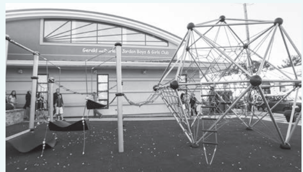
The Stacey L. Monkiewicz Playground at the Gerald and Darlene Jordan Club