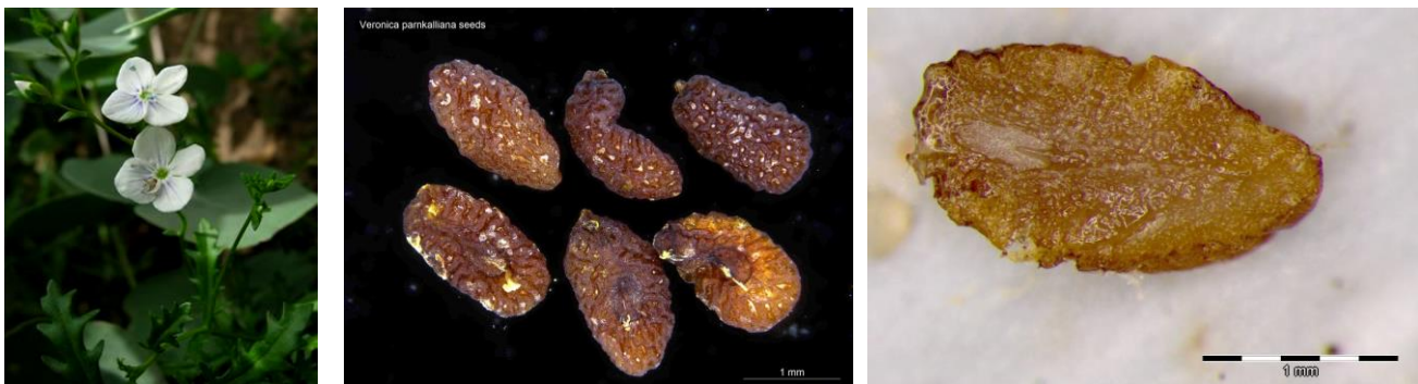
Figure 1. A) Flowers, buds and leaves B) seeds and C) longitudinal cut showing the underdeveloped embryo.