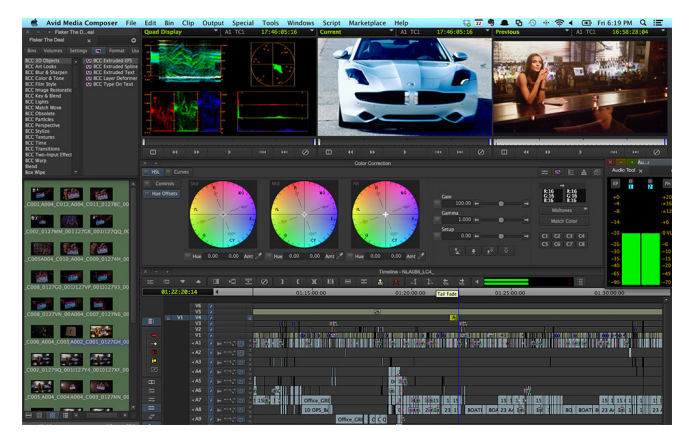
Bundle Artist | DNxIO with Media Composer to maximize your HD and high-res efficiency.