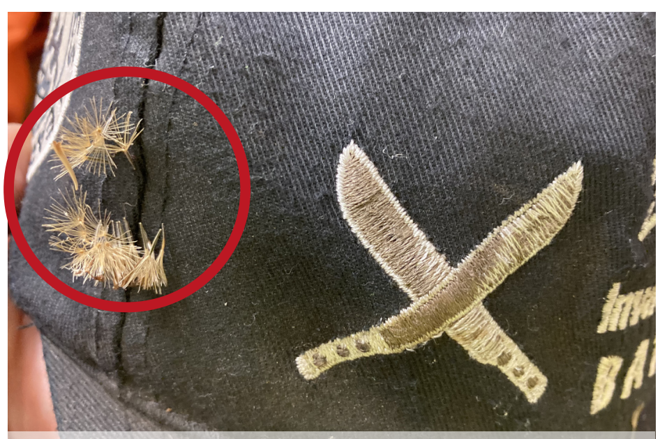
A single plant can produce up to 800,000 seeds per year, which readily disperse via the wind or by sticking to clothing, gear, or fur.