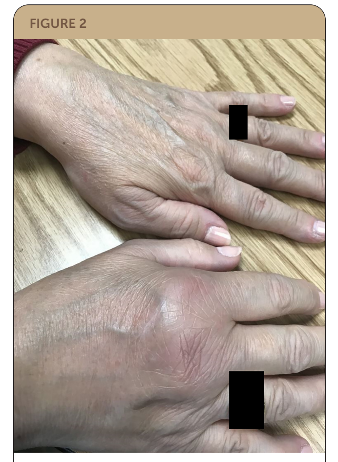
A patient with psoriatic arthritis presenting with second and third metacarpophalangeal joint synovitis in the right hand. There is mild erythema and swelling in the right hand compared with the unaffected left hand.

many nonrheumatic diseases, such as HIV and hepatitis C infection, autoimmune thyroid diseases, and autoimmune liver diseases.<sup>30</sup> Low titer antinuclear antibodies (1:40) are present in approximately 30% of healthy people.<sup>31</sup> Presence of antinuclear antibodies itself, regardless of titer, does not necessarily indicate that an autoimmune disease is present.