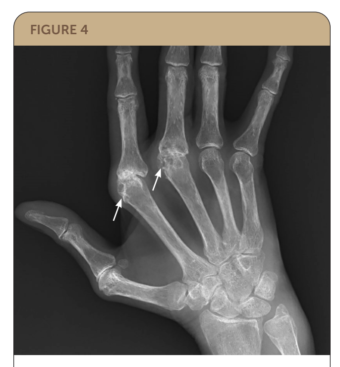
Marginal erosions of the second and third metacarpal heads (arrows) in rheumatoid arthritis.

Classically, radiography has been the preferred standard for imaging and can show erosive changes from RA<sup>39</sup> (Figure 4). It is commonly used because it is cost-effective and widely available. Whereas radiography is not as sensitive to the