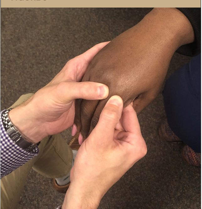
Metacarpophalangeal joint two-finger examination technique. The metacarpophalangeal joint is in flexion at approximately 45 degrees. The hand is palpated along the lateral and medial margins of the metacarpophalangeal joint. Synovitis will feel boggy and thickened compared with an unaffected joint, and palpation may elicit tenderness.

(100\times10^9 per L). ^{33} In cases of noninflammatory arthritis, the white blood cell count typically ranges from 200 to 2,000 per \mu L (0.2 to 2\times10^9 per L). Reactive arthritis is an inflammatory arthritis that typically occurs within one month of an infection (often genitourinary or gastrointestinal). ^9 However, unlike septic arthritis, the synovial fluid in reactive arthritis is sterile.