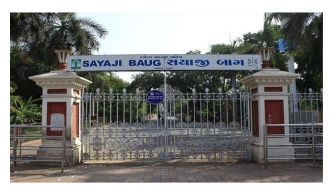
Fig 3: Palm house, Royal Botanic Gardens, Kew

Sayaji Baug is a garden located in Vadodara, Gujarat, India. It is also known as "Kamati Baug," built by H. H. Maharaja Sayaji Rao Gayakwad (who established it in 1879 over an area of 40 hectares.) - a great visionary ruler of Baroda. This place famous for the first collection of unique branching palm ( Hyphaene thebaica ).