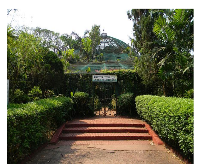
Fig 2: Large palm house

This garden was founded in 1787 by Colonel Robert Kyd, an army officer of the East India Company. The Large Palm House containing rich collection of palms including Lodoicea maldivica (the double coconut palm); branching palm ( Hyphaene thebaica ) introduced from Egypt; The century Palm ( Corypha macropoda ).