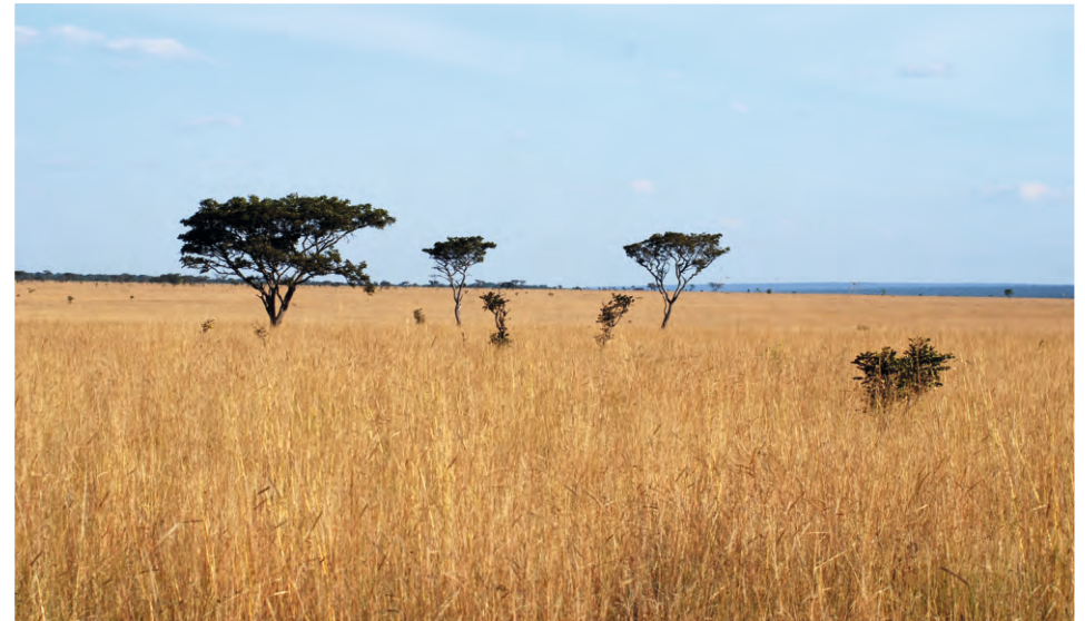
Fig. 6: Parinari capensis grassland on sandy soils at the start of the dry season; tall Poaceae and solitary Burkea africana trees dominate the appearance at this time of the year.