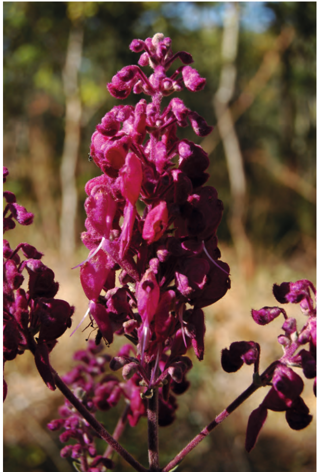
Fig. 11: Alvesia rosmarinifolia a typical species of the Miombo woodlands of the Cusseque core site.

Protea welwitschii form an integral part of community composition and dominate the vegetation at the end of the dry season and the beginning of the rainy season, although with a much smaller underground biomass than in the Cryptosepalum maraviense grasslands (Fig. 5 and 6).