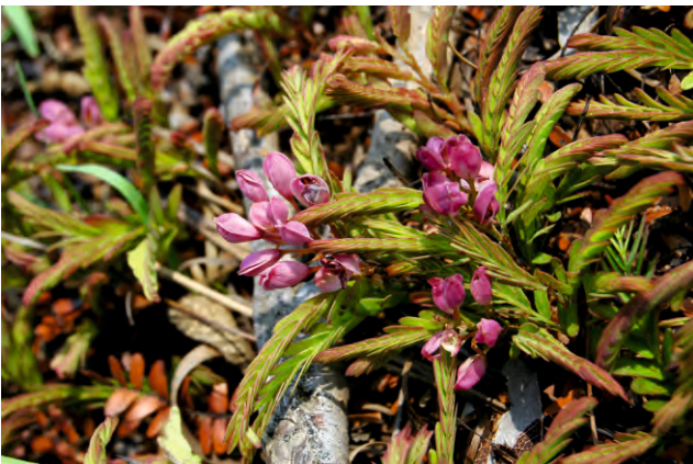
Fig. 10: The dwarf shrub Cryptosepalum maraviense referred to as “Cassamba” in the local language.