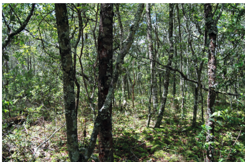
Fig. 1: Closed Miombo forests dominated by Cryptosepalum exfoliatum ssp. pseudotaxus with thick moss layer on the ground and stems covered by lichens.

of the core site exhibit mixed stands of Brachystegia spiciformis , Brachystegia bakeriana and Cryptosepalum exfoliatum ssp. pseudotaxus including various Combretum species. The canopy is less closed and trees are mostly semi-