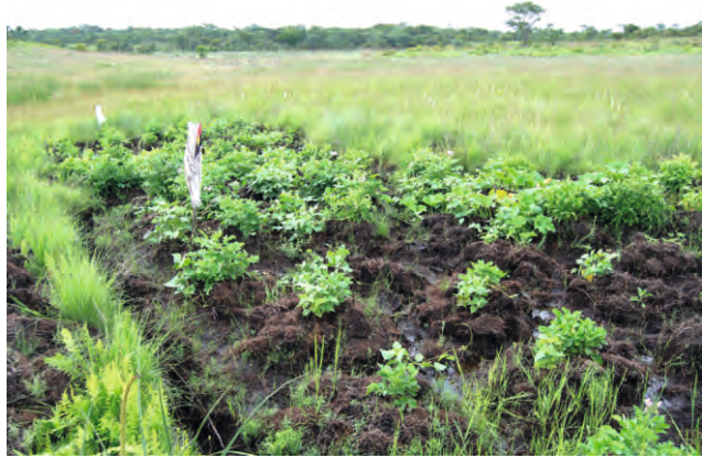
Fig. 8: Horticulture in the peatlands at the headwaters of a small tributary.