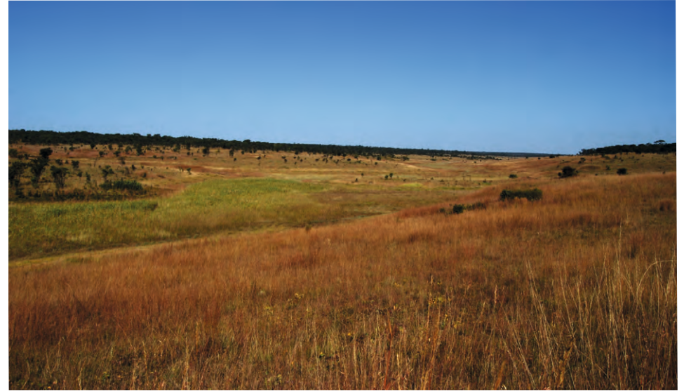
Fig. 4: Cryptosepalum maraviense grassland on ferralitic soils along the slopes at the end of the rainy season in May. At this time, grasses dominate the aspect of this vegetation unit. Peat bogs are located at the valley bottom in the centre of the photo (photo: R. Revermann).