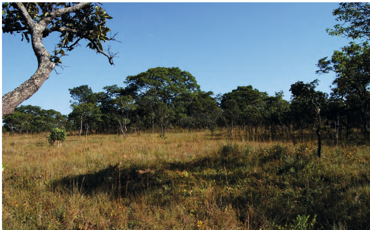
Fig. 2: Shrubland ecotone.

Parinari capensis grasslands (on sandy soils): This vegetation unit is spatially clearly delimited and is found in the core site on the plains along the eastern side of the Cusseque River. It typically occurs on sandy deposits along larger river systems such as the Longa River. The main aspect in the late rainy season is shaped by several tall grass species such as Monocymbium ceresiiforme , Stipagrostis spp., and Hyparrhenia spp. amongst others. However, geoxylic suffrutices such as Parinari capensis , Ochna arenaria , Ochna cinnabarina , Syzygium guineense ssp. huillense , and