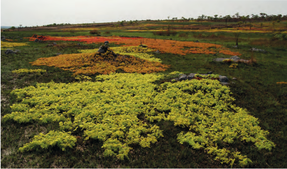
Fig. 3: Cryptosepalum maraviense grassland (Anhares de Ongote / Cassamba) in October just before the onset of the first rains showing colourful resprouts of Cryptosepalum maraviense ; grasses are not present yet.