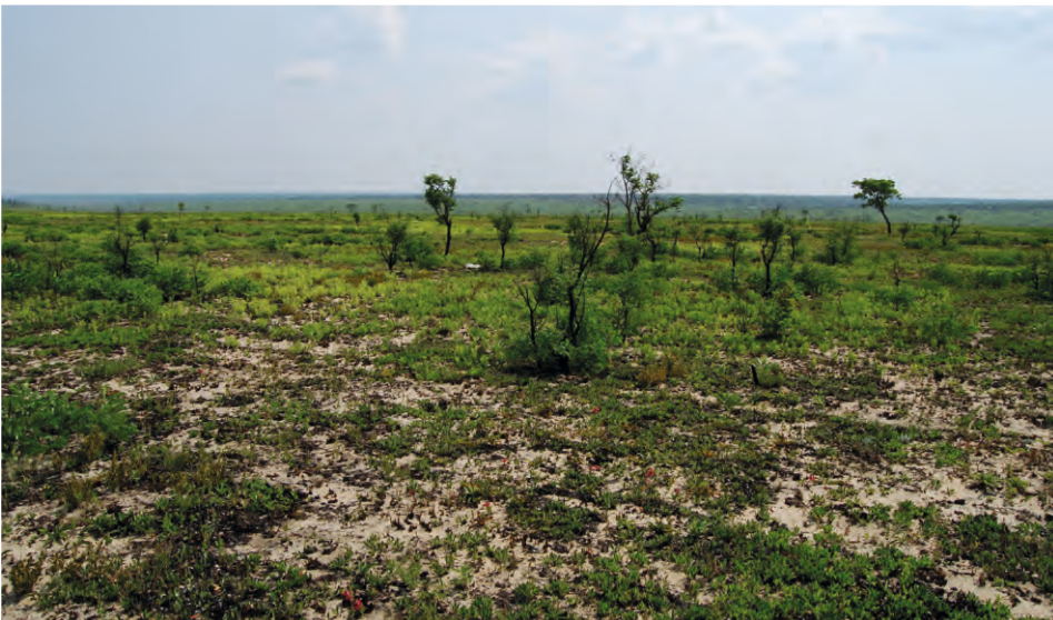
Fig. 5: Parinari capensis grassland (on sandy soils) at the beginning of the rainy season.