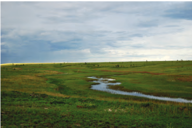
Fig. 9: Reed beds and open water along the Cusseque River.