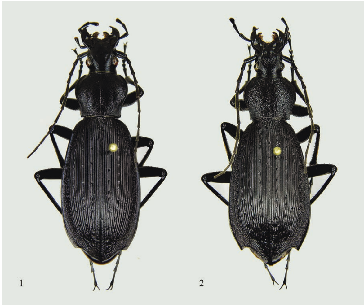
Figure 1. Carabus (Apotomopterus) kassandra planielongatus n. ssp., holotype. Figure 2. Carabus (Apotomopterus) benardi alterego n. ssp., holotype.

Carabus (Apotomopterus) cyanipennis atripennis n. ssp. - Figs. 3–5 - http://zoobank.org/845a5e85-5740-4782-84ef-7c94ac91600c