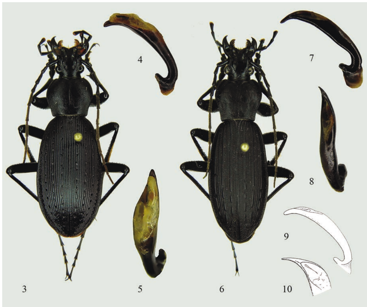
Figures 3–5. Carabus (Apotomopterus) cyanipennis atripennis n. ssp. Fig. 3: holotype. Fig. 4: paratype male, aedeagus in lateral view. Fig. 5: paratype male, aedeagus in dorsal view. Figures 6–8. Carabus (Apotomopterus) tonkinensis hagiangensis n. ssp. Fig. 6: holotype. Fig. 7: paratype male, aedeagus in lateral view. Fig. 8: paratype male, aedeagus in dorsal view. Figures 9, 10. Carabus (Apotomopterus) tonkinensis yenbaiensis Deuve, 2013. Fig. 9: male aedeagus in lateral view, original draw by Deuve, 2013. Fig. 10: idem, male aedeagus in dorsal view, original draw by Deuve, 2013.

type is temporarily housed at the author's collection in Cialla di Prepotto (Udine, Italy) waiting to be definitively deposited in a public Institution.