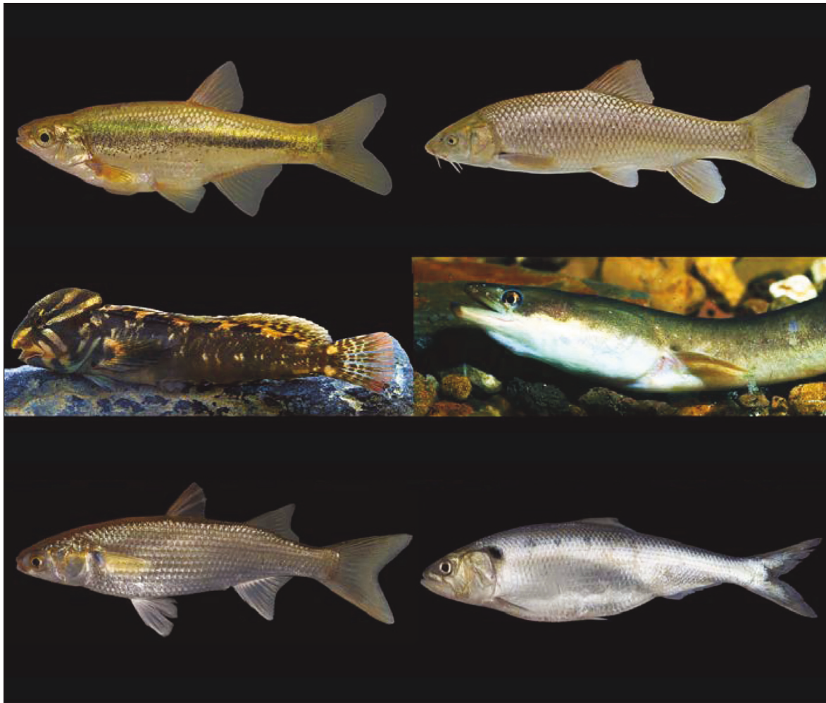
Figure 3. Examples of native species collected during this study. Anticlockwise from top left: Tropidophoxinellus callensis , Soummam River, Algeria; Salaria fluviatilis , Oued Boughzazene, Algeria; Mugil cephalus , Atlantic coast; Morocco; Right from top: Luciobarbus setivimensis , Soummam River, Algeria; Anguilla anguilla , Rhine River, Germany; Alosa algeriensis , Soummam River, Algeria.

but self-sustaining populations now exist across northern Algeria.