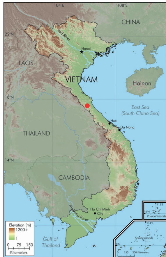
Figure 1. Map showing the location of Phong Nha - Ke Bang National Park, Quang Binh Province, Vietnam.