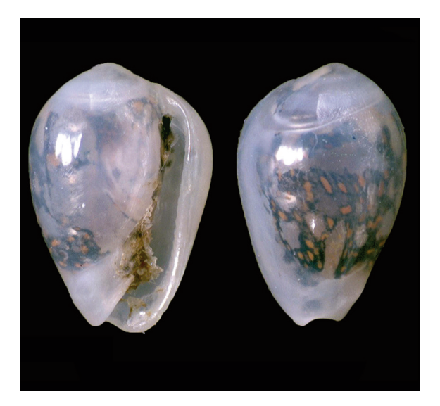
Figure 4. Gibberula philippi from Capo d'Armi, Strait of Messina.

ranean Sea. The marginellid Gibberula recondita Monterosato, 1884 nevertheless, is a typical western species, unknown in the eastern Mediterranean basins (Gofas, 1990), while G. marginata and G. philippi (Fig. 4), which are the most tied to the western basins (Gofas, 1990; Boyer et al., 2002), have been sporadically reported in the eastern areas, but without confirmation by pictures of shells and observations on the mollusc chromatic patterns. The same G. philippi in the Strait of Messina might be represented by a not yet investigated species complex.