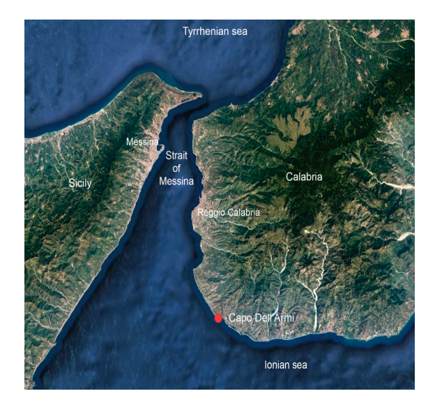
Figure 1. Study area: Capo d'Armi, Strait of Messina.

Capo d'Armi (Fig. 1), the Greek-Roman "Leucopetra", represents the southeastern limit of the Strait of Messina. The backdrops have been recognized as sites of Community importance since 2000 (SIC code IT9350140), with a high degree of vul-