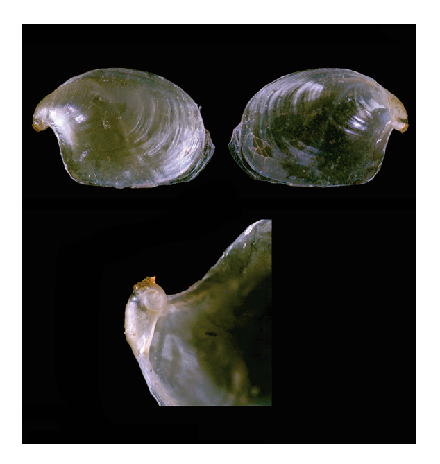
Figure 5. Aplysia parvula from Capo d'Armi, Strait of Messina.

The Caraibic Sea hare, Aplysia parvula (Fig. 5), that we report for the first time in the Strait of Messina, despite its western Atlantic origin, in Mediterranean Sea has been first recorded in the eastern basin, from Turkish waters (Swennen, 1961). Numerous but often unconfirmed records affected both Atlantic and Mediterranean coasts of Spain and Balearic Islands (Terlizzi et al., 2005; Koukouras, 2010; Scuderi & Terlizzi, 2012). Such peculiar Amphi-Atlantic and Mediterranean distribution, however, may suggests a cryptogenic status of the