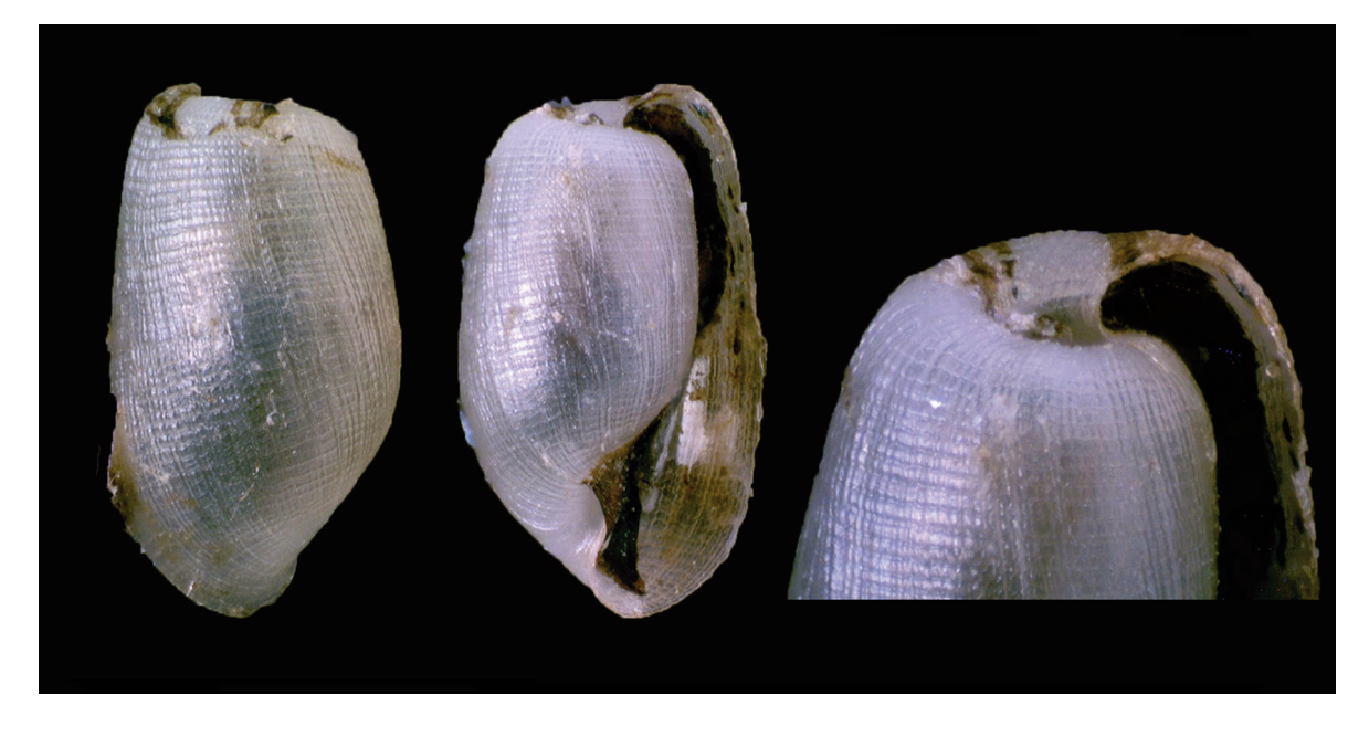
Figure 6. Notodiaphana atlantica from Capo d'Armi, Strait of Messina.

The Thecosomata H. inflatus , belonging to a species complex which includes Atlanto-Mediterranean, Indo-Pacific, South Eastern Atlantic and North Indian entities, in Mediterranean is known from the western basins. Limacina trochiformis is abundant in the South Western and Eastern areas (Rampal, 2017), similarly to S. subula and to the epibathyal P. reticulata , which shows a disjoined distribution in Alboran sea and Eastern basin (Rampal, 1975, 2011).