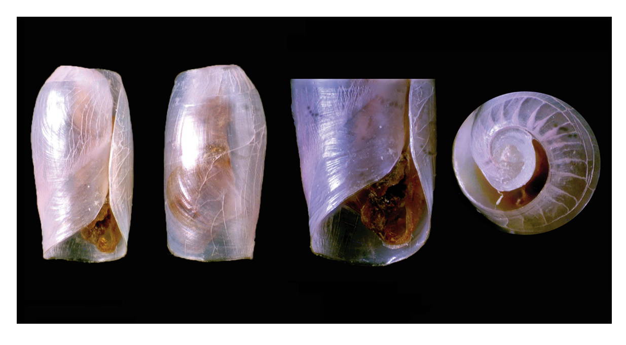
Figure 8. Ascobulla fragilis from Capo d'Armi, Strait of Messina.

We wish to thank Franck Boyer (Garrigues Sainte Eulalie, France), Danilo Scuderi (Catania, Italy), Francesco Pusateri (Palermo, Italy), Italo Nofroni (Roma, Italy) their suggestions and contribution in species determination.