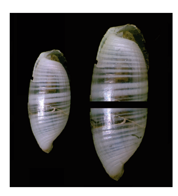
Figure 7. Atys macandrewi from Capo d'Armi, Strait of Messina.

The present report provides a first contribution to the mollusc diversity in a poorly investigated area, although the latter is full of interest in the