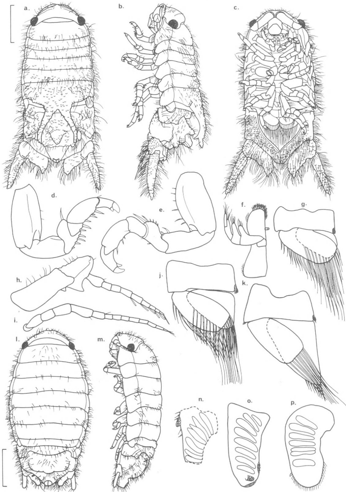
FIG. 3: Dynamene ramuscula Baker. Adult male (a) dorsal, (b) lateral, (c) ventral, (d) pereopod 1, (e) pereopod 3, (f) maxillipede, (h) antennule, (i) antenna, (g, j, k) pleopods 1-3 respectively, (n) proximal external margin of damaged exopod of pleopod 4, (o) exopod of pleopod 5, (p) endopod of pleopod 5. Ovigerous female (l) dorsal, (m) lateral. Scales represent 1 mm.