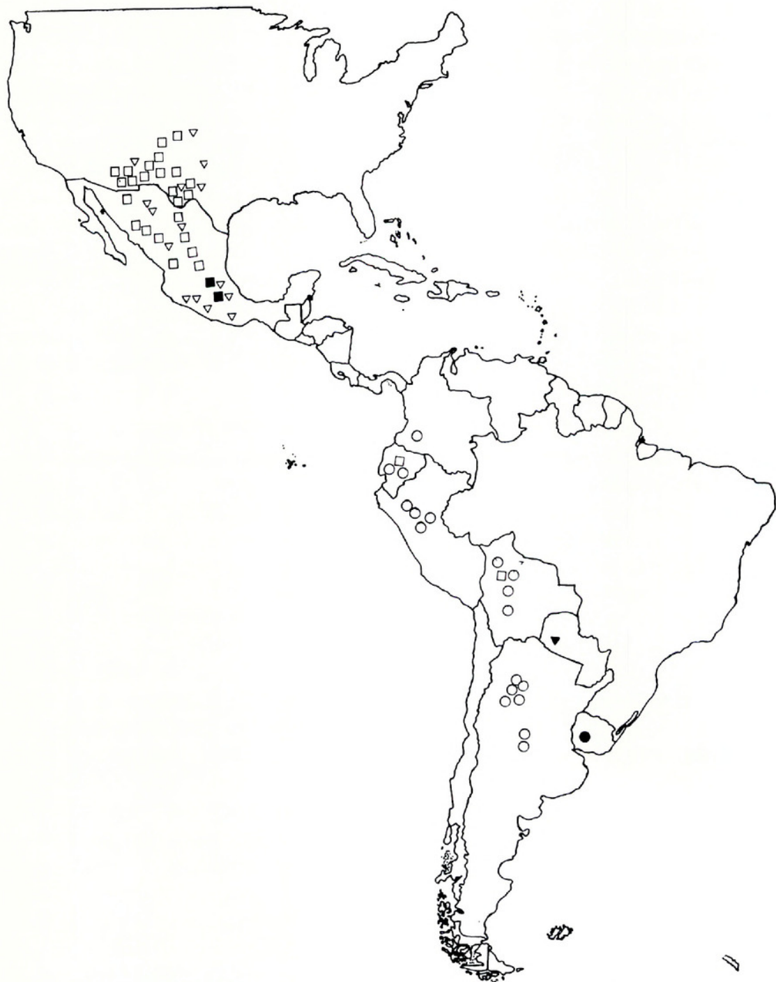
Figure 2. DISTRIBUTION OF SUBGENUS GUILLEMINEA. Hollow square, G. densa var. densa ; solid square, G. densa var. humilis ; hollow triangle, G. densa var. aggregata ; solid triangle, G. australis ; open circle, G. densa var. gracilis ; solid circle, G. elongata .

specimens; sepals united into a 5-part calyx; each calyx lobe with the central sepal nerve continuing less than \frac{2}{3} the length of the free calyx lobe, which is a hyaline membrane except for the sepal nerve; nerve usually without chlorophyll; filament tube barely visible above the level of adnation to the calyx.