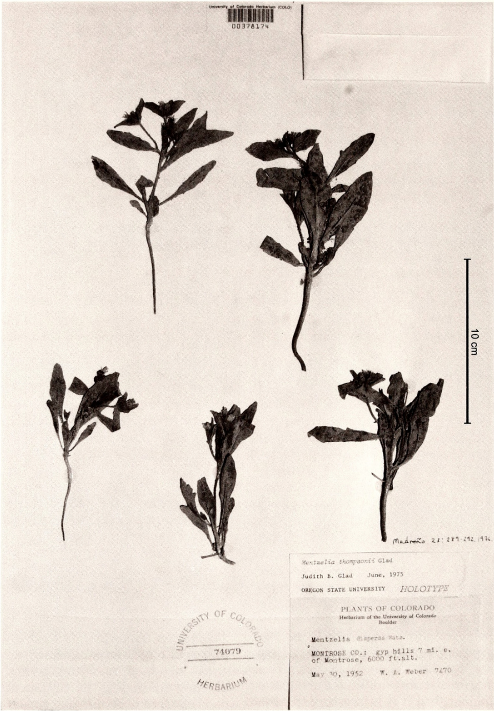
FIG. 4. Holotype of Mentzelia thompsonii Glad.