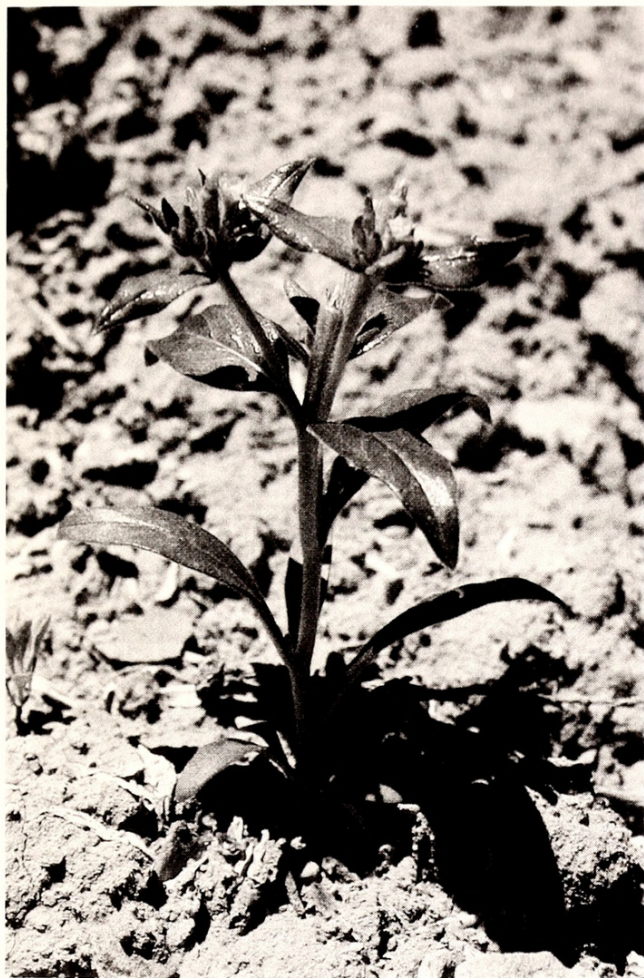
FIG. 1. Habit of Mentzelia thompsonii Glad.

distribution of M. thompsonii . Chromosome counts were made from field-collected microsporocytes fixed in Farmer's solution (3 parts 95% ethanol: 1 part glacial acetic acid) at the time of voucher collection. Following the procedures outlined by Windham (2000), fixed materials were stored at -20^{\circ}\text{C} and transferred to 70% ethanol immediately before making slides. Dissected anthers were macerated in a drop of 1% acetocarmine stain, which was mixed 1:1 with Hoyer's solution prior to setting the cover slip and squashing. Slides were examined with an Olympus BH-2 phase contrast microscope, and representative cells were photographed using Kodak Technical Pan 2415 film. The voucher specimens, Brokaw 234 (WS375612) and Brokaw 345 (WS375773), have been deposited at the Marion Ownbey Herbarium (WS). Additional duplicate vouchers have been sent to ACU and COLO.