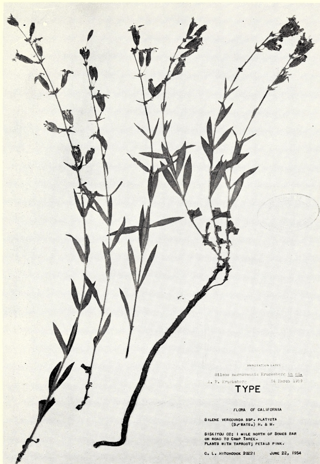
FIG. 1. Type specimen of Silene marmorensis , Hitchcock 20221 (WTU 179156), \times \frac{1}{3} .

over one-half its length, the lobes oblong, entire to slightly erose at tip, appendages two, broadly oblong, truncate, the free margins entire; stamens slightly exserted, crowded at throat, the filaments 11–13 mm. long, glabrous throughout; pollen tawny brown in color; carpophore 3–4