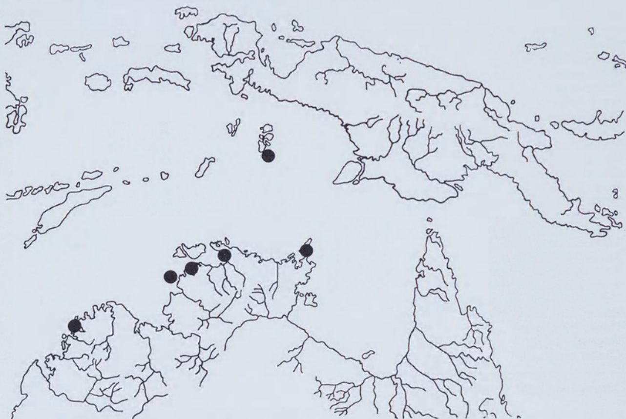
Fig. 2. Distribution of Apogon fusovatus .

tralia between York Sound, Western Australia and the Wessel Islands, Northern Territory, and the Aru Islands, Indonesia.