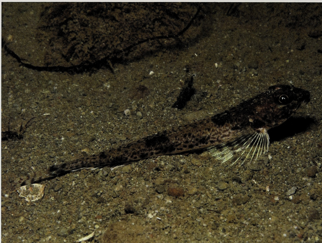
Fig. 2. Asemichthys taylori photographed at 12 m depth at Bordelais Islets (48°48.98'N, 125°13.9'W), Barkley Sound, British Columbia. Note 1) dark lower half of the head, 2) light band behind the eye, and 3) blue edging to some of the saddles, characters identical to those in the Esalen Pinnacle fish.