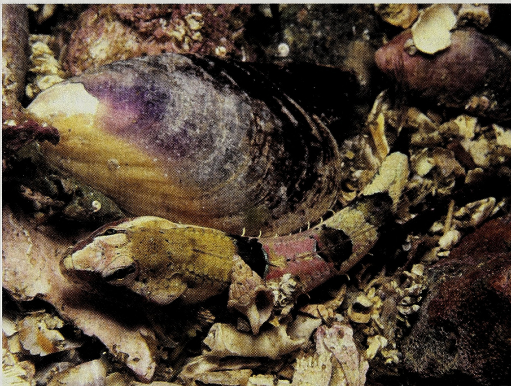
Fig. 3. Asemichthys asprellus photographed at 18 m depth at Ayer's Point, Hood Canal, Washington. Note the extremely long nasal spines that are absent in A. taylori .