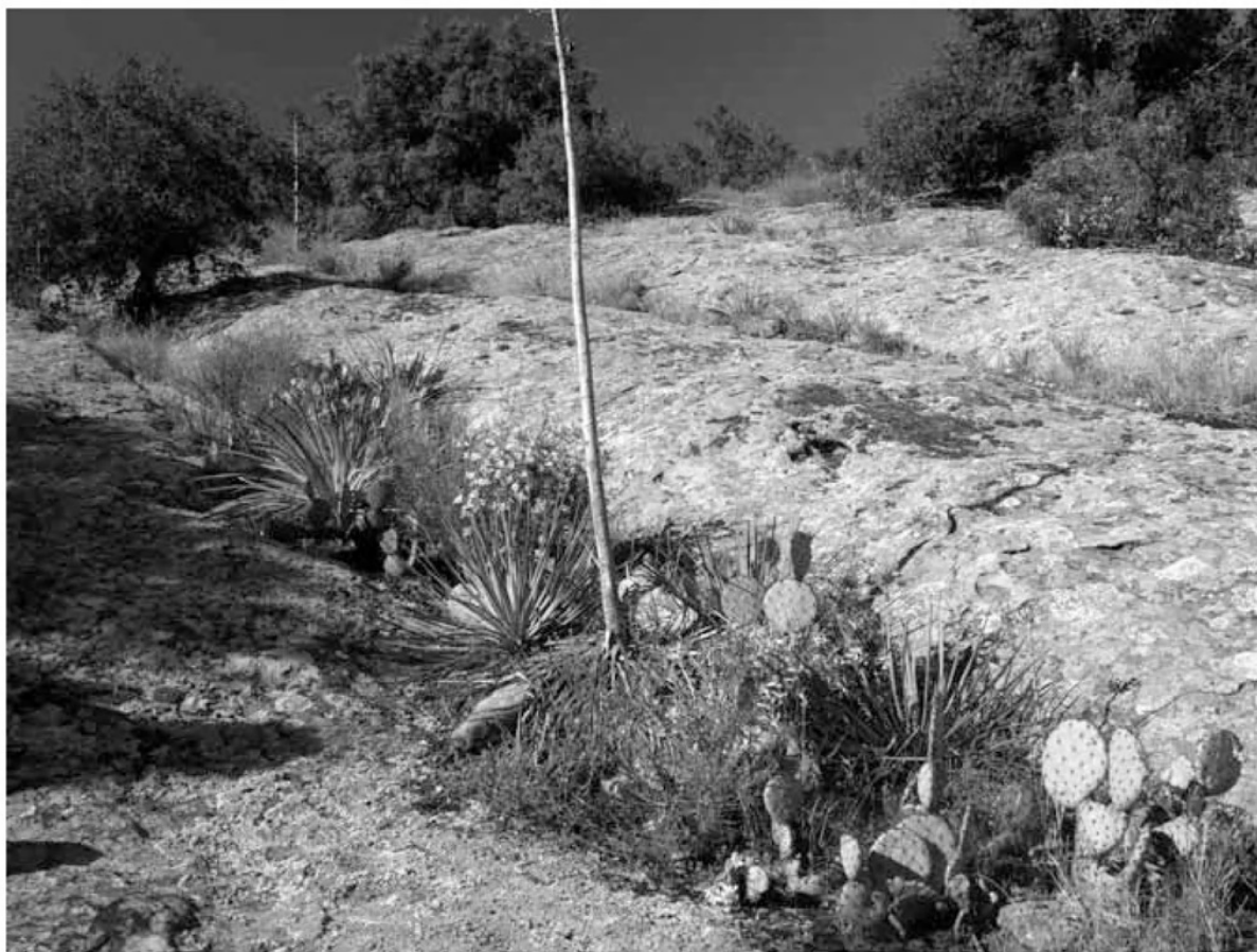
Fig. 2. Weir Canyon sandstone slabs.

The northwestern end of the Santa Ana Mountains is in Orange County along the Santa Ana River west of Sierra Peak and in the foothills and valleys bordering Santiago Creek on the edge of the coastal plain. Sandstones predominate. Oak