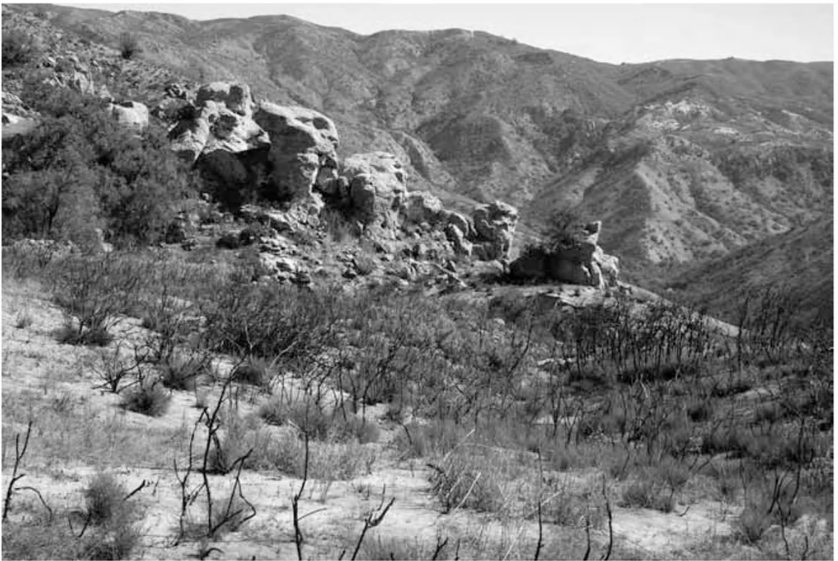
Fig. 3. Upper Fremont Canyon. Fire burned lichens off many boulders.

This was the first professional lichen inventory in Orange County. We collected 597 specimens of lichens and lichenicolous fungi, which were curated and databased at the Herbarium of the University of California at Riverside (UCR). Weir Canyon was surveyed in 2006. Fremont Canyon was surveyed in 2007 and 2008 after fire devastated the canyon in early 2006, and this part of the study was twice interrupted by the Weir Canyon fire in February 2007 and the Santiago fire in October 2007. Over 60 days were spent in the field. Collecting was intuitive and subjective. Some days no collections were made due to the devastation caused by the Fremont Canyon fire, which incinerated many acres of all lichens (Fig. 3). Thin-layer chromatography (TLC) was performed on selected specimens by J. C. Lendemer (NY) and J. A. Elix (CANB).