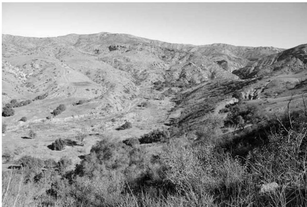
Fig. 1. Fremont Canyon.

KEYWORDS: Biodiversity, California, Fremont Canyon, Floristics, Orange County, Weir Canyon.