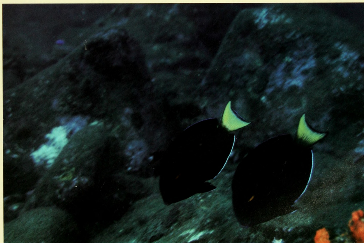
FIGURE 6. Subadults of Acanthurus reversus about 90 mm TL, Eiao, Marquesas Is.