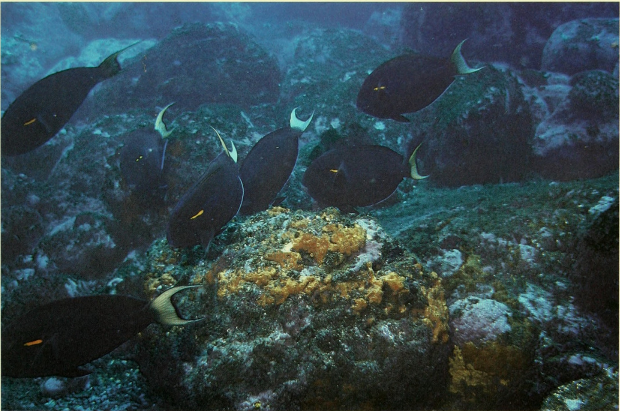
FIGURE 4. Group of adult Acanthurus reversus feeding, Eiao, Marquesas Is.