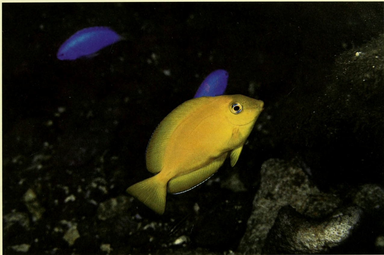
FIGURE 5. Juvenile of Acanthurus reversus about 45 mm TL, Nuku Hiva, Marquesas Is.