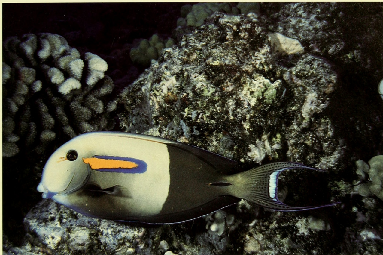
FIGURE 1. Adult of Acanthurus olivaceus , about 240 mm TL, Kona, Hawaii.