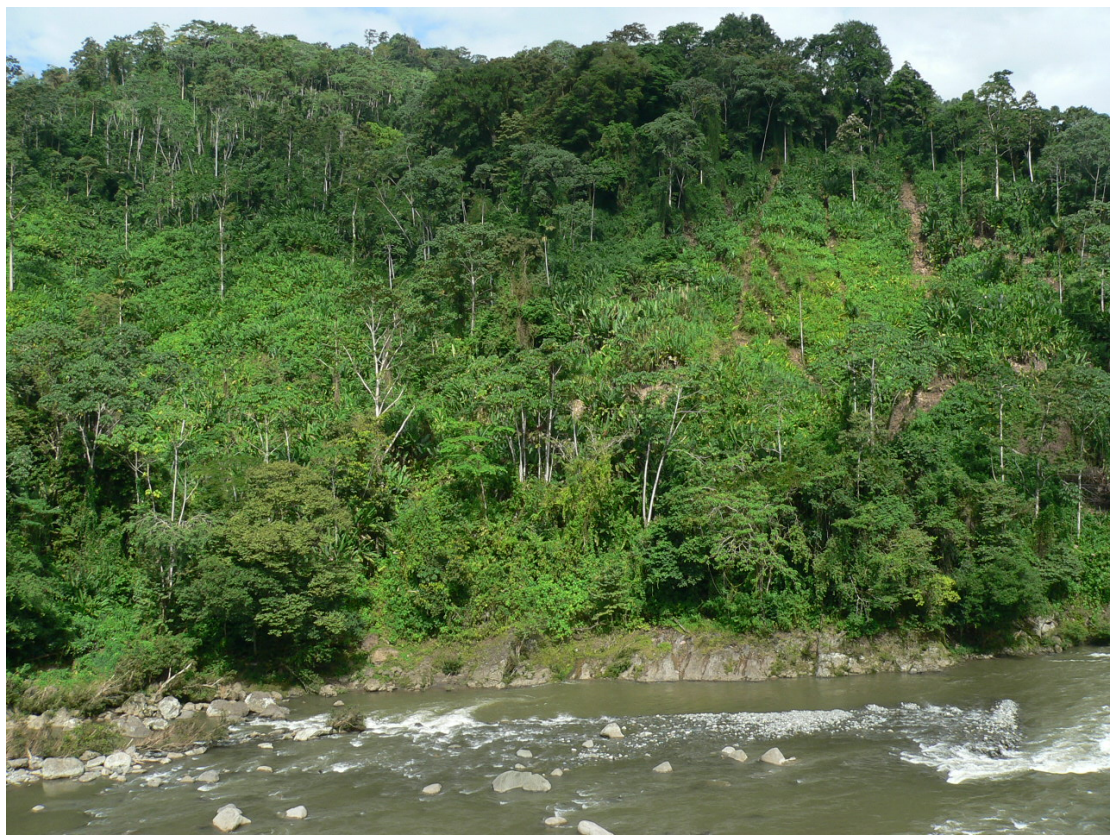
Photo by Linda Barrera (2007) Changuinola River, site of Chan-75 dam. The reservoir will reach up to the top of the tree-line, where workers have begun cutting down the trees.

International Park by blocking their migratory routes.<sup>62</sup> In addition, the impact on aquatic species will cause cascading effects on the terrestrial species of the Park, including threatened and endangered species. Finally, the reservoirs resulting from the creation of these dams threaten the outstanding natural beauty of La Amistad International Park.