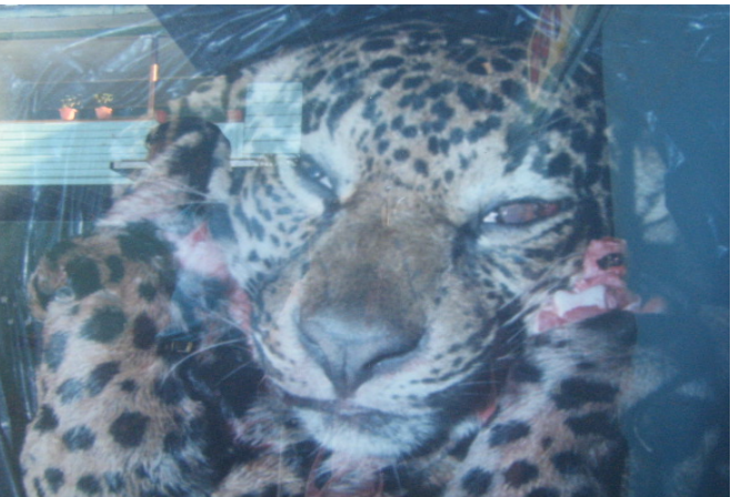
Photo by Octavio Guerrero (2006) A jaguar poached outside of Boquete.

and Tayassu tajuca ), and jaguar.<sup>150</sup> The poachers reportedly enter the Park through three unofficial, but well-known entrances in Boquete.<sup>151</sup> While actual numbers on the amount of species under threat from hunting do not exist, uncontrolled poaching continues to pose a grave danger to the Park's outstanding biodiversity.