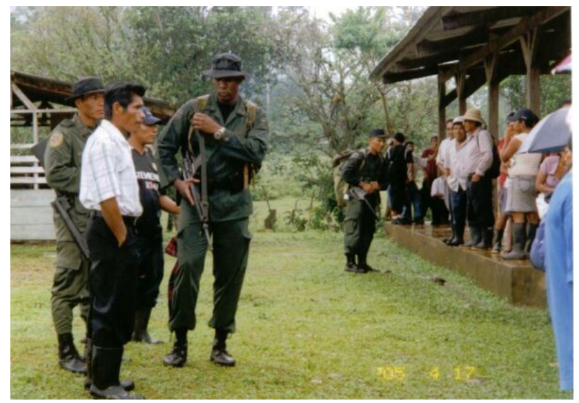
Photo by Jason Jacques Paiement (2005) Panamanian armed policemen at a Naso General Assembly meeting.

exacerbated the armed conflict between the government forces and the Naso people, the majority of whom oppose the Bonyic Dam.<sup>105</sup>