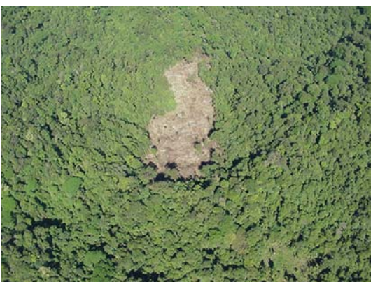
(circa 2005) Aerial view of deforestation in the Park.

Local environmental groups have filed lawsuits against illegal landholders. In one incident, an environmental group in Boquete, a town in Chiriqui Province abutting the Park, reported a man clearing forest to build a road leading to his illegal claim inside the Park.<sup>142</sup> The group filed a lawsuit to enjoin this particular activity, but the government has failed to prosecute all such actions and the problems continue.<sup>143</sup> In addition, in Las Nubes, another town in Chiriqui Province near the Park's boundary, several corporations claim rights to land within the Park.<sup>144</sup> These corporations are the subject of a lawsuit because they have deforested large portions of the Park.<sup>145</sup> Furthermore, some of these corporations continue to violate the laws protecting the Park and, in some instances, have constructed ecotourism infrastructure inside the Park.<sup>146</sup> Thus far, the government has not redressed the controversy.<sup>147</sup> Taken together with the indigenous settlements, these landholdings have cleared approximately 4,000 ha of forest, or two percent of the Park, between 1986 and 2000.<sup>148</sup> The current level of deforestation is unknown.