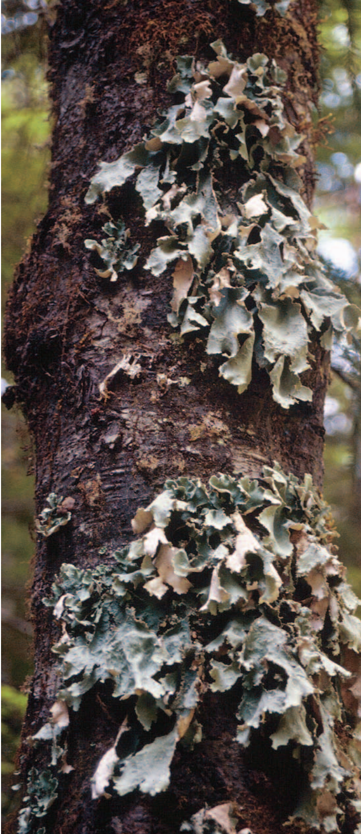
Rare nitrogen fixing lichen, Pseudocyphellaria rainierensis .