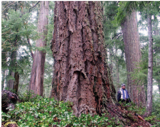
Ancient Douglas-fir on Cobble Knob.

Based on these conclusions, the Cobble Creek Timber Sale was canceled and a remnant, biologically important stand of old-growth forest was protected, benefiting the lichen, other old-forest dependent species and in the long run, the whole ecosystem.