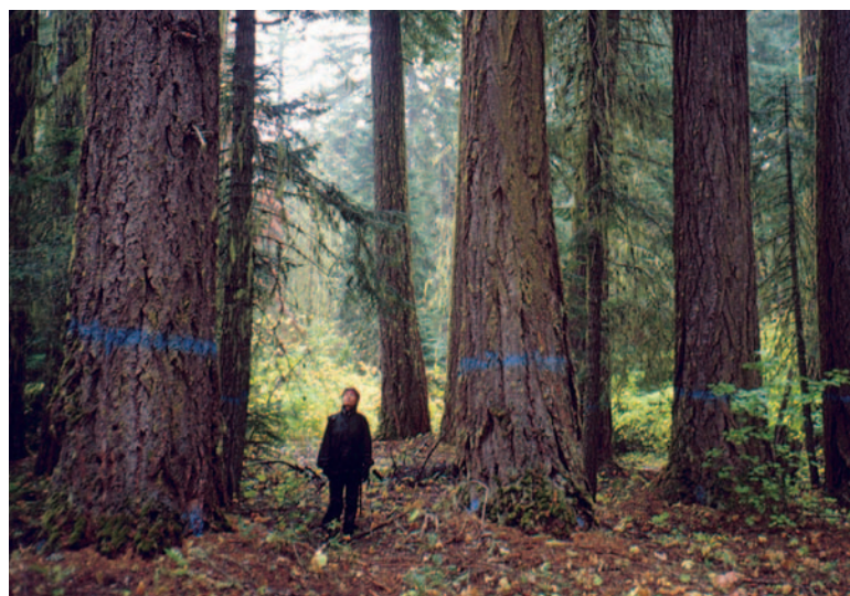
Old-growth Douglas-fir marked to be cut in the Juncrock Timber Sale.

Mollusks, including snails, slugs and clams, are a major component of the biological diversity of the Pacific Northwest, with at least 350 species known, of which 102 are closely associated with old-growth forests. Mollusk species help cycle nutrients in forested ecosystems by consuming leaves and other plant matter, and are an important food source for many aquatic and terrestrial species. The Northwest Forest Plan was less effective at protecting mollusks than any other group because Northwest mollusk species have small ranges, and are concentrated at low elevation where there are fewer reserves. It is thus not surprising that mollusks have been located in many old-growth timber sales. The following are just a few examples of timber sales that were stopped or modified to ensure the survival of rare mollusks under the Survey and Manage Program: