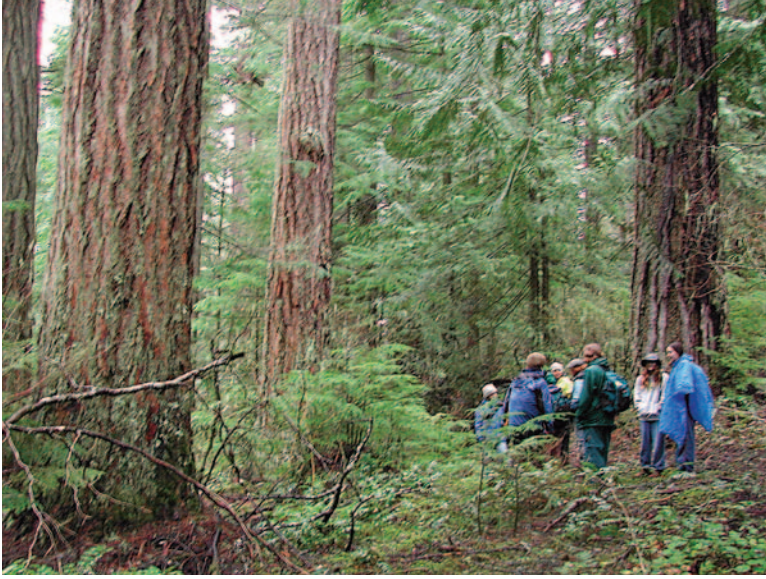
Old-growth habitat on the Straw Devil Timber Sale in the Willamette National Forest.