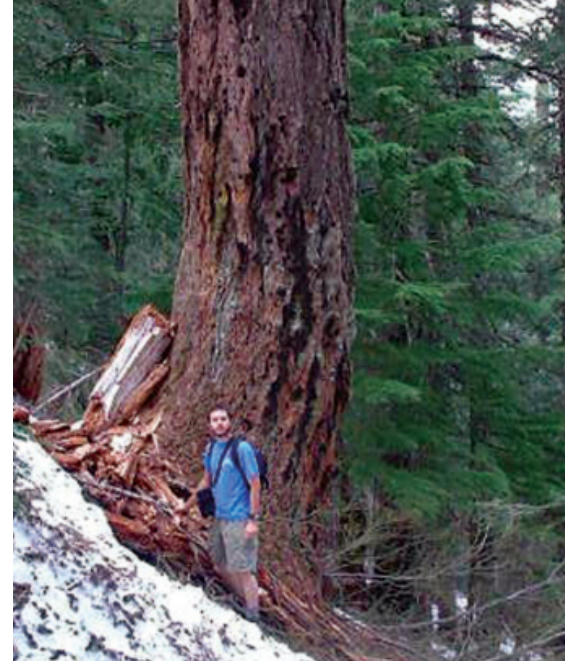
Ancient tree in the La Roux Timber Sale protected by the Survey and Manage Program.

Only found in the Cascade Mountains of southern Washington and northern Oregon, the Larch Mountain salamander is extremely rare. Despite extensive surveys in Washington, less than 100 sites have been found. Surveys conducted in the La Roux Timber Sale found 47 new salamander sites, including 38 in a single logging unit, a true hotspot for the rare Larch Mountain salamander.