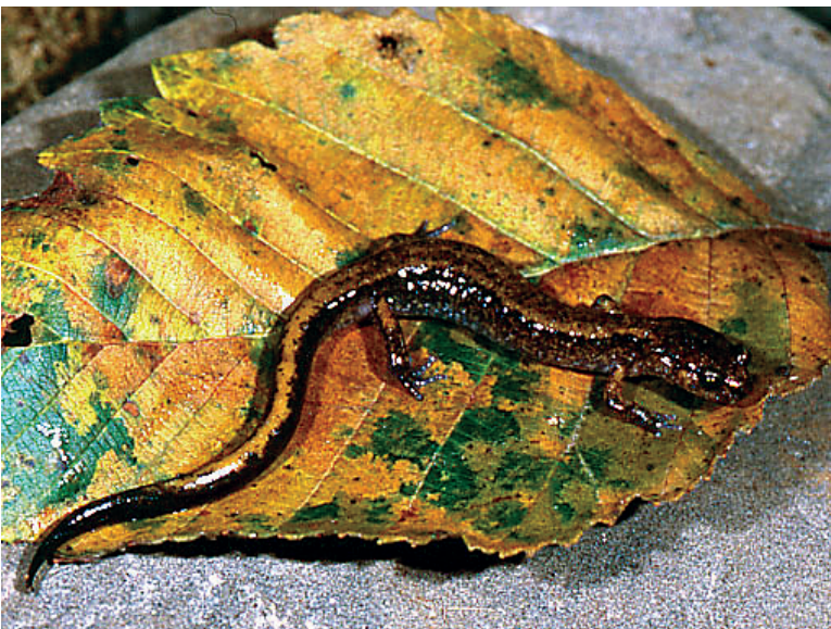
The Dunn's salamander.