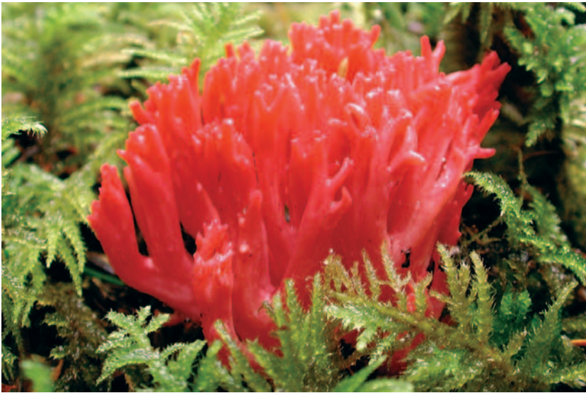
Ramaria araiospora , a rare old-growth forest fungi.