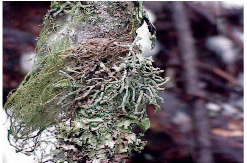
High lichen diversity in the Juncrock Timber Sale.