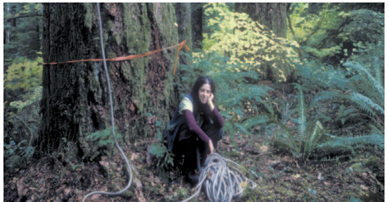
A NEST volunteer ready to climb and look for red tree voles.

In the Straw Devil Timber Sale, for example, NEST volunteers spent over a month climbing five-foot diameter Douglas-fir and incense cedar, finding over two dozen nest sites in one cutting unit alone. This 100 acre old-growth timber sale on the Willamette National Forest now has been modified, protecting some of this biologically important remnant low-elevation old-growth forest. In total, over 12 timber sales have been withdrawn or reduced in size to safeguard the red tree vole. Because the red tree vole is one of the northern spotted owl's primary food sources, it is not too much to say that protecting the vole helps to provide for the owl.