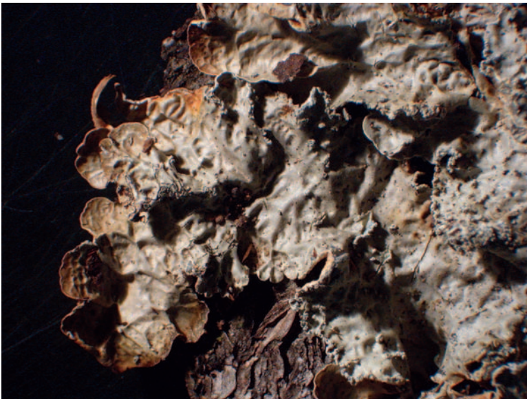
The cryptic paw lichen ( Nephroma occultum ) only grows in the branches of very old trees (over 400 years).

In 1996, the BLM began cutting trees in the 110 acre Cobble Creek Timber Sale on Cobble Knob in southwestern Oregon. With Douglas-fir and sugar pine over six feet in diameter, the old-growth forest found on Cobble Knob is an island in a sea of young tree plantations—the last wild place of its size for miles and a textbook example of a refugium for old forest species.