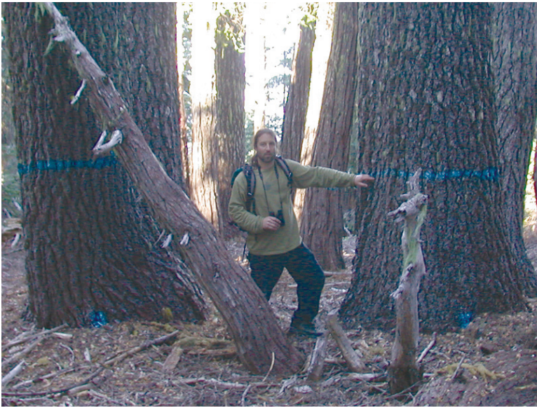
Ancient forest marked for logging in the Deadwood Timber Sale.