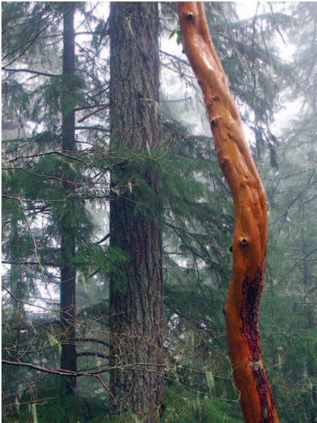
Madrone and Douglas-fir on Cobble Knob.

🌳 Amphibians are an important link in the food chain, serving as a major food source for other animals and controlling populations of the many terrestrial and aquatic species that comprise their prey.