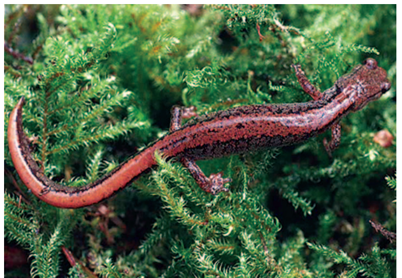
The rare Larch Mountain salamander lives in moisture laden old forests, and forests with deep talus and rocky substrates.

The La Roux Timber Sale on the Gifford Pinchot National Forest would have logged 6.2 million board feet from 360 acres, including 52 acres of old-growth habitat in the Little White Salmon River watershed. This old-growth logging