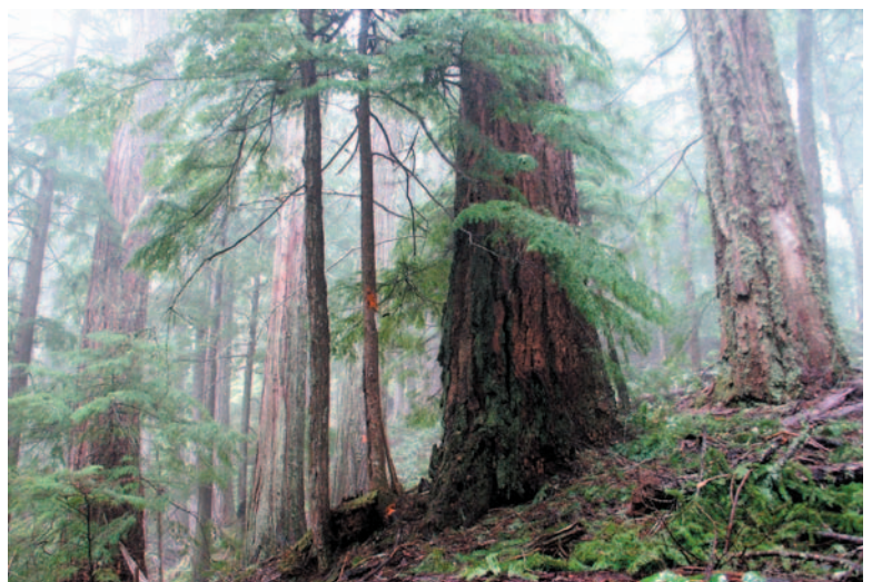
Ancient forest on Cobble Knob.