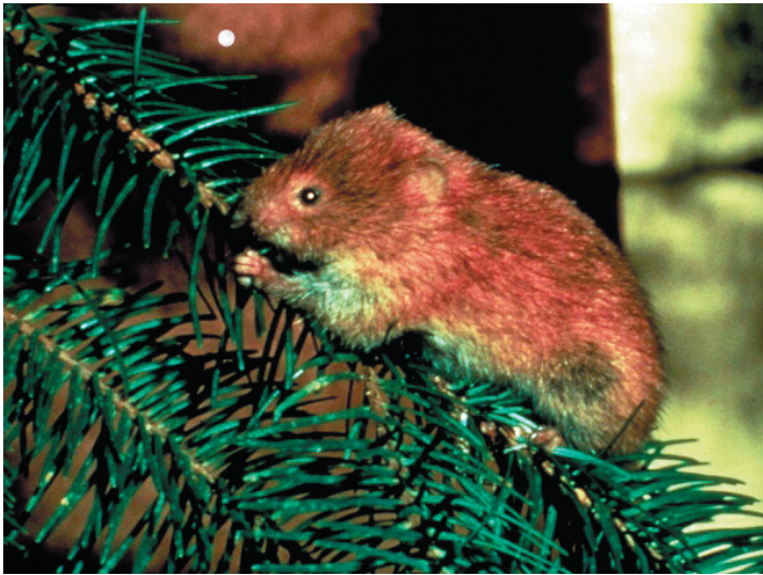
The unique Oregon red tree vole feeding on Conifer needles.