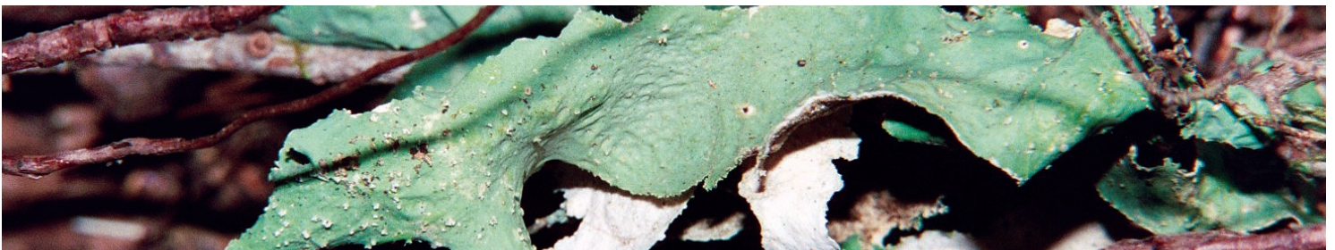
The rare lichen Pseudocyphellaria rainierensis is eliminated by clearcutting and slow to disperse to young developing stands, making it vulnerable to extirpation.