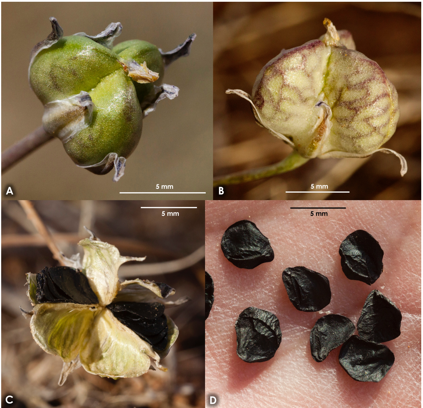
FIGURE 3. Fruits and seeds of Muilla lordsburgana : A , immature fruit at 32.4684°N 108.7055°W, 19 Mar 2017; B , mature fruit at 32.4686°N 108.6456°W, 28 Mar 2017, collection site of Alexander 1565 ; C , dehiscent fruit at 32.5133°N 108.7016°W, 7 Apr 2017; D , seeds at 32.5133°N 108.7016°W, 7 Apr 2017.