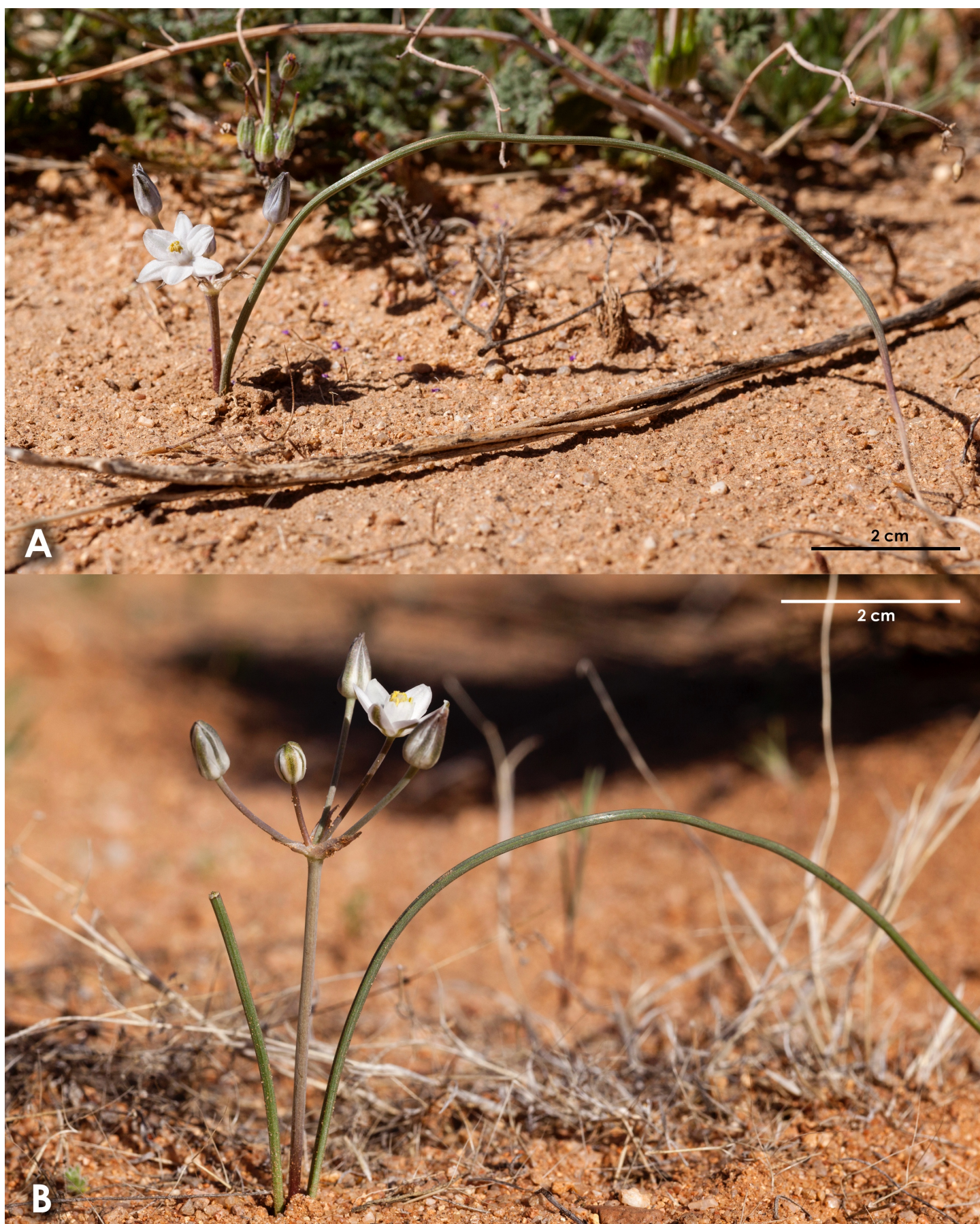
FIGURE 1. Muilla lordsburgana at: A , 32.4686°N 108.6456°W, 17 Mar 2017, site of Alexander 1565 ; B , 32.5336°N 108.7057°W, 19 Mar 2017, site of Alexander 1566 .