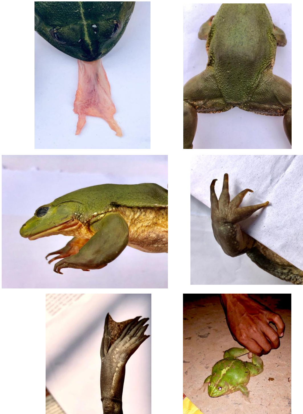
FIGURE 4. Euphlyctis bengalensis . Bifid tongue (upper left), ‘U’ shaped structure between thighs (upper right), vocal sac opening in male (middle left), finger (middle right), white spotted line in foot (lower left), a live female (lower right).