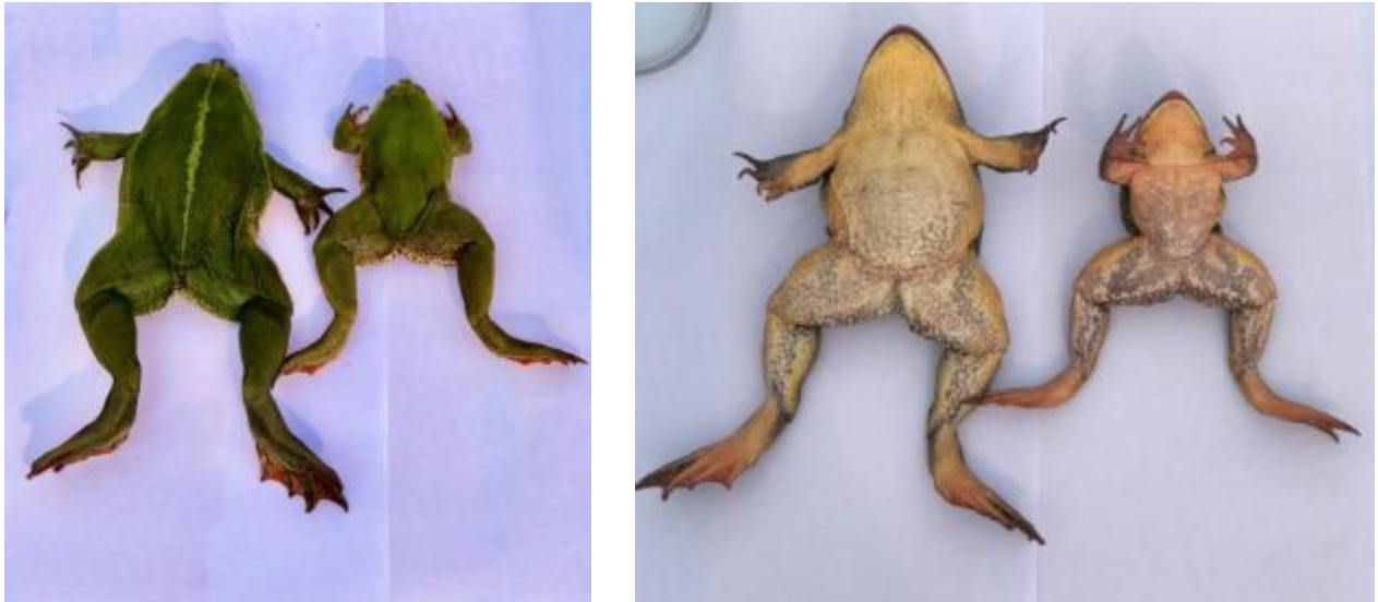
FIGURE 1. Euphlyctis bengalensis . Adult female and male: Dorsal view (left), ventral view (right).