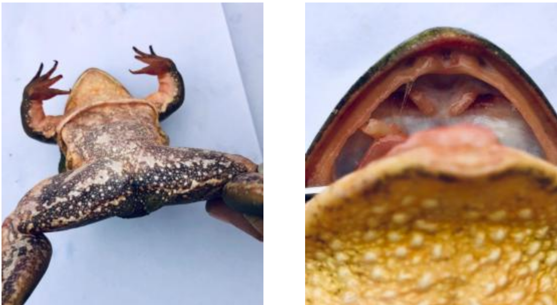
FIGURE 2. Euphlyctis bengalensis . Posterior of thigh (left), interior of mouth showing fossa on upper jaw (right).