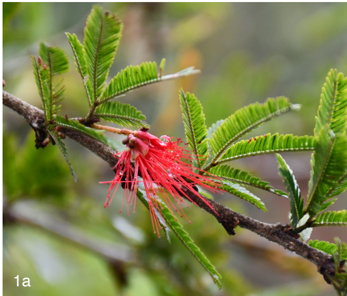
Fig. 1. Inflorescences showing synandrous flowers of 1a. Calliandra taxifolia 1b. Zapoteca caracasana 1c. Albizia lebbek 1d. Inga laurina