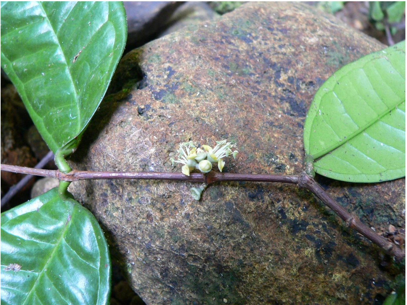
Fig. 1 Memecylon ebo Flowering branch of Prenner 23.