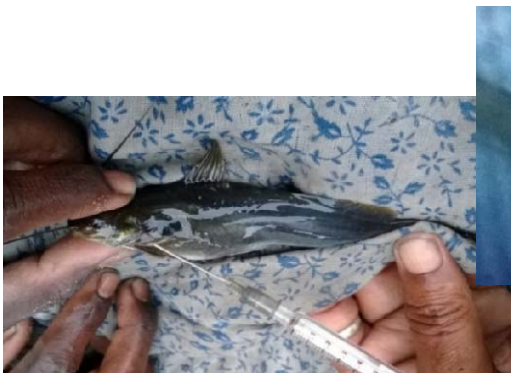
Fig 2: Hormone injection