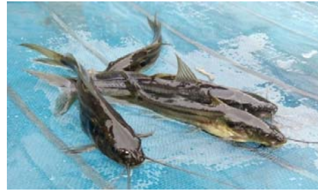
Fig 1B: Male brooders