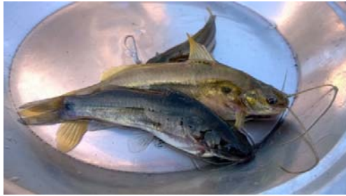
Fig 1A: Female brooders of M. dibrugarensis