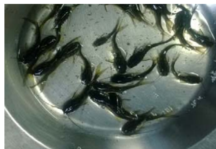
Fig 5: Fingerlings