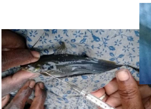
Fig 2: Hormone injection