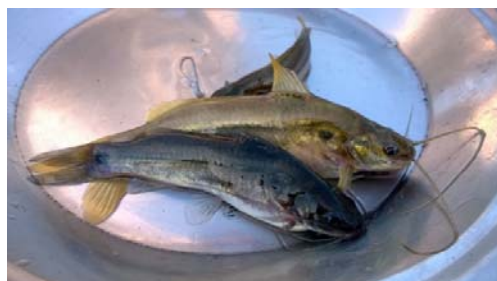
Fig 1A: Female brooders of M. dibrugarensis