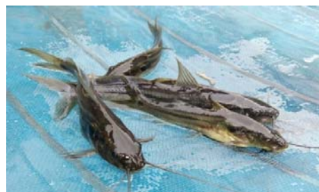
Fig 1B: Male brooders