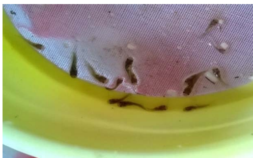
Fig 4: 15 th day fry