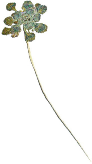
Fig. 1) The pressed herbarium type specimen of Viola unica . (Photo - A.R. Flores, 25 Aug 2008)