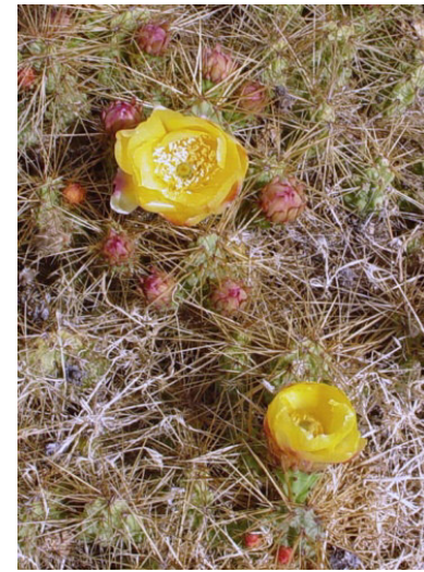
Fig. 11) Maihueniopsis boliviana .