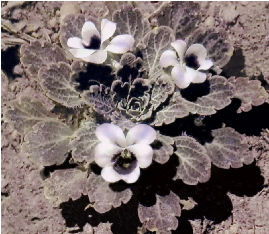
Fig. 18) Viola roigii .