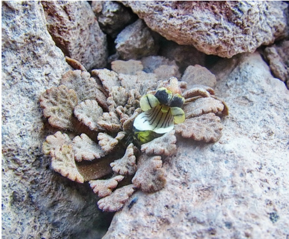
Fig. 17) Viola gelida . (Photo - 11 Dec 2011. Courtesy of M.P. Cárdenas and Cedrem)