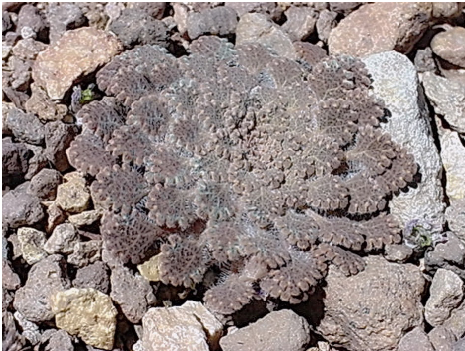
Fig. 16) Viola lullaillacoensis .