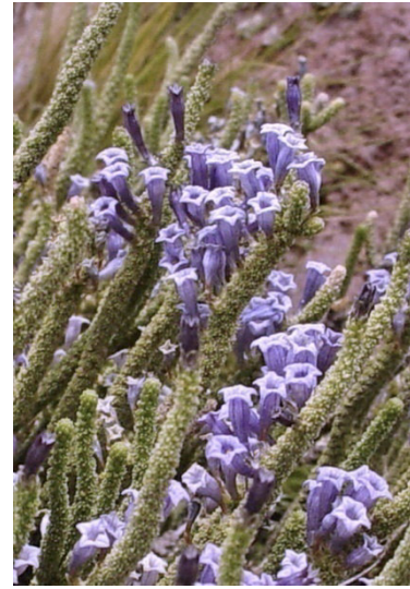
Fig. 9) Fabiana bryoides . (Photo - A.R. Flores, 6 Jan 2006)