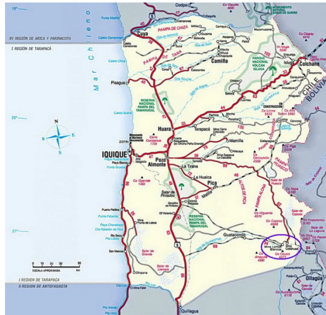
Fig. 6) Tarapacá Region, northern Chile, with violet-ringed area within which Viola unica occurs.