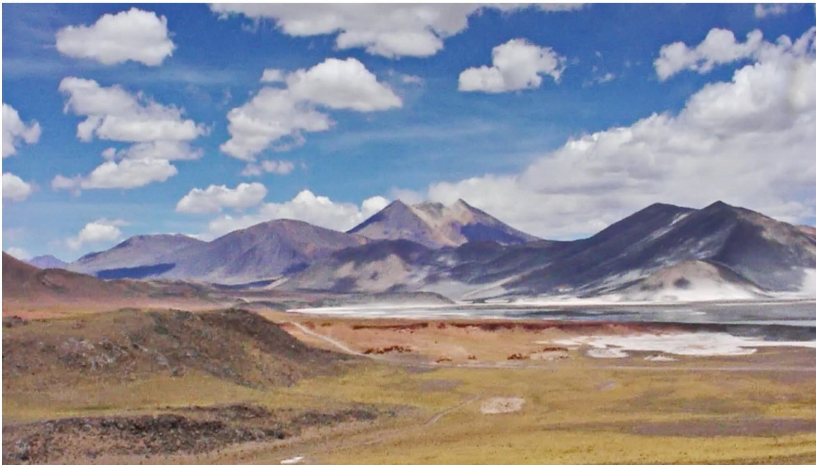
Fig. 7) Typical Chilean high Altiplano landscape and vegetation, shortly to the south of Collahuasi, type area of Viola unica . (Photo - A.R. Flores, 6 Jan 2006)