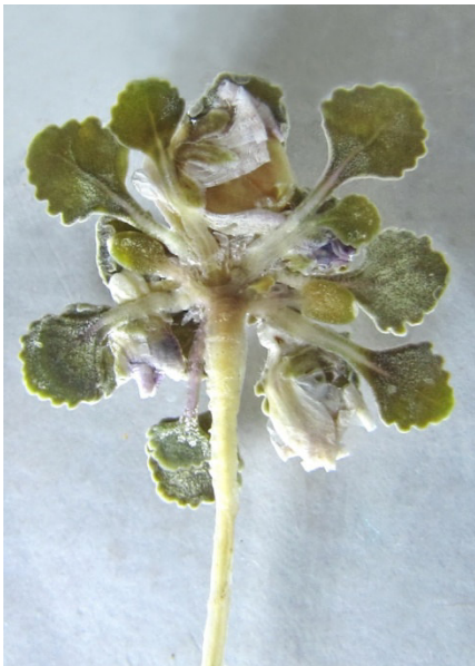
Fig. 3) Underside of rosette of soaked type specimen of Viola unica . (Photo - A.R. Flores, 7 June 2019)