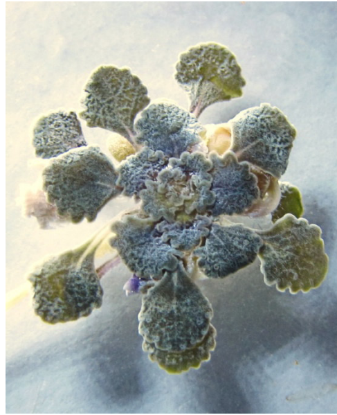
Fig. 2) Plan view of rosette of soaked type specimen of Viola unica . (Photo - A.R. Flores, 7 Jun 2019)