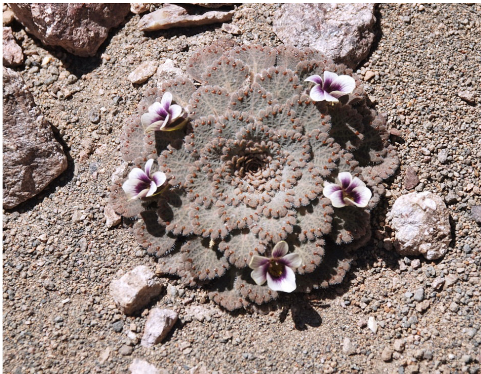
Fig. 25) Viola congesta . (17 Dec 2013)