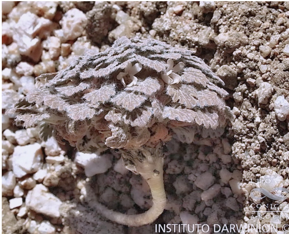
Fig. 14) Viola flos-idae . (Photo - 28 Jan 2013. Courtesy of Instituto Darwinion, Buenos Aires)