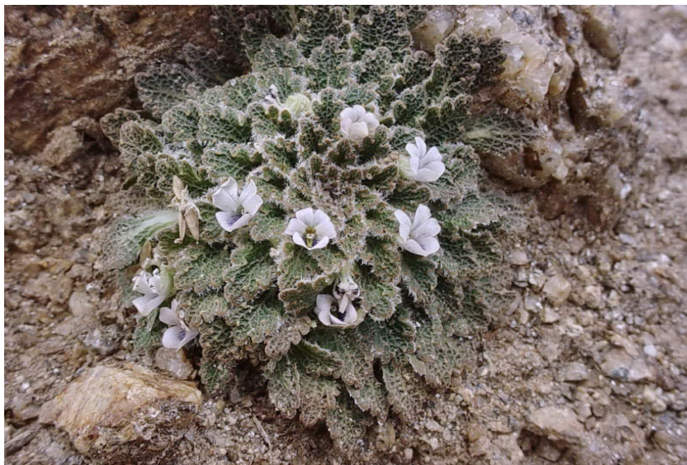
Fig. 15) Viola joergensenii . (Photo - A.R. Flores, 13 Feb 2007)