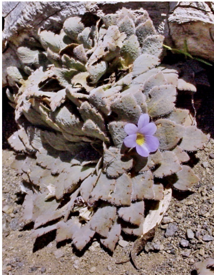
Fig. 23) Viola farkasiana . (Photo - A.R. Flores, 25 Dec 2002)