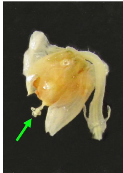
Fig. 4) Preserved Viola unica flower showing peduncle with basal bracteoles, ripe capsule, and attached trilobed style crest arrowed green. (Photo - A.R. Flores, 7 Jun 2019)