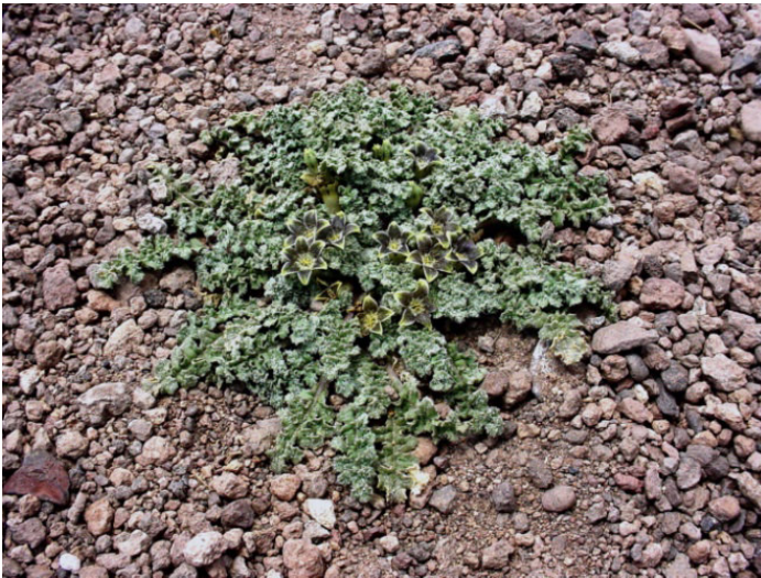
Fig. 10) Jaborosa parviflora . (Photo - A.R. Flores, 6 Jan 2006)