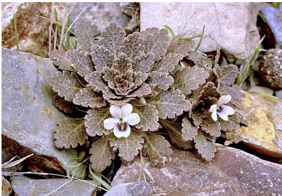
Fig. 19) Viola xanthopotamica .