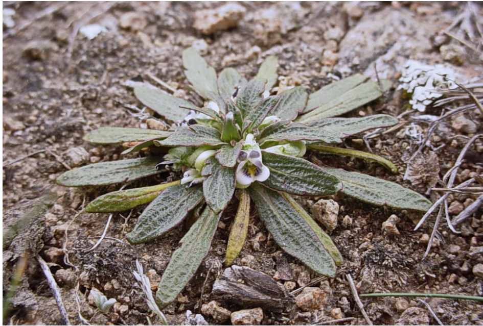
Fig. 12) Viola triflabellata . (Photo - A.R. Flores, 14 Mar 2007)