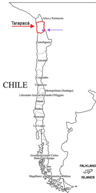
Fig. 5) South America. The regions of Chile with Tarapacá, where Viola unica is endemic, outlined and arrowed red. General location of Viola unica arrowed violet.