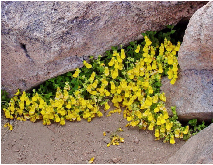
Fig. 8) Calceolaria stellariifolia . (6 Jan 2006)