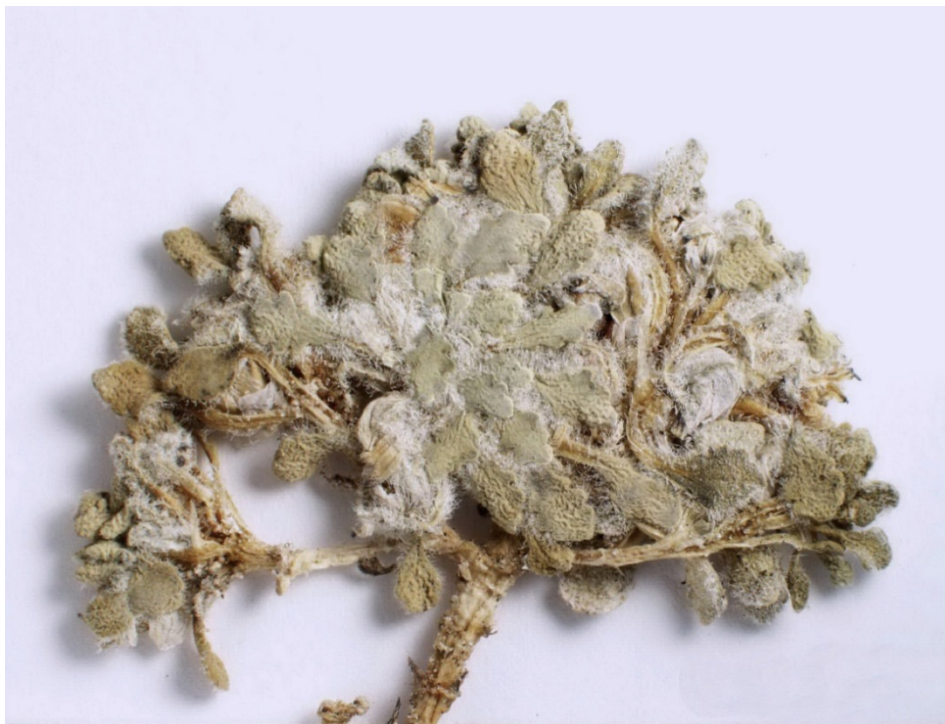
Fig. 13) Viola beati .