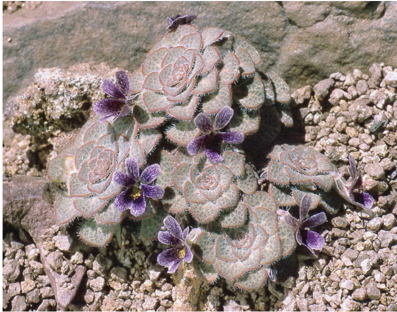
Fig. 22) Viola rubromarginata .