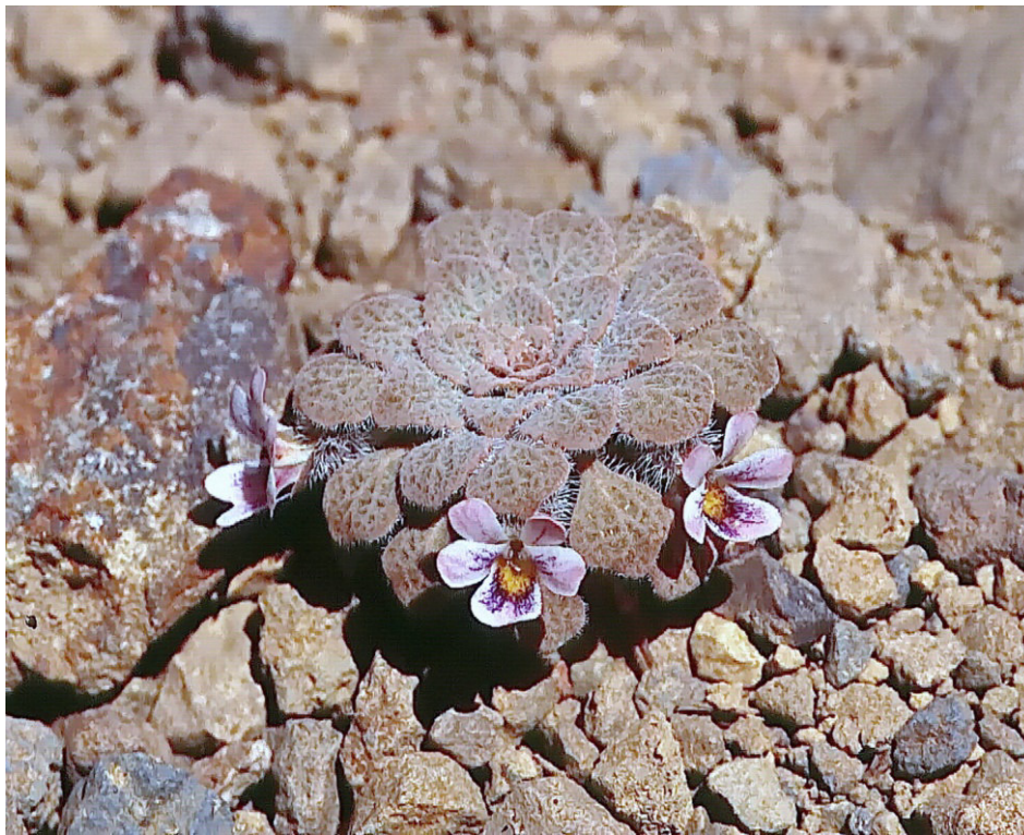
Fig. 21) Viola rugosa . (Photo - J.M. Watson, 7 Feb 2003)