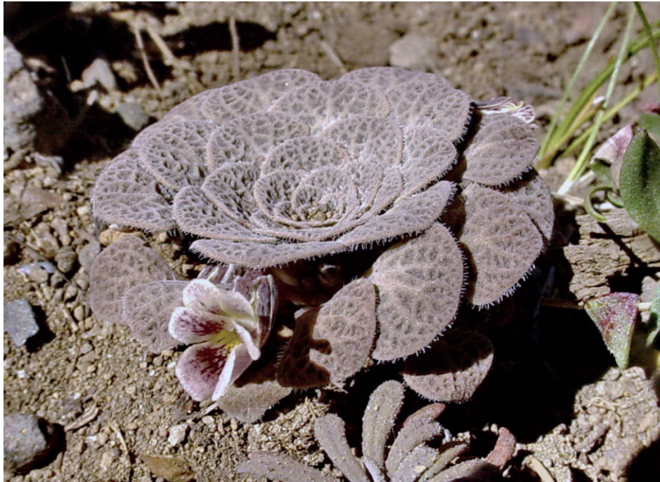
Fig. 20) Viola trochlearis . (Photo - A.R. Flores, 21 Dec 2007)