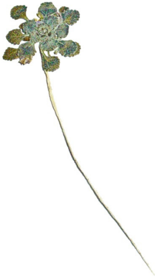
Fig. 1) The pressed herbarium type specimen of Viola unica . (Photo - A.R. Flores, 25 Aug 2008)