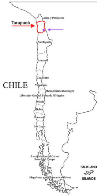
Fig. 5) South America. The regions of Chile with Tarapacá, where Viola unica is endemic, outlined and arrowed red. General location of Viola unica arrowed violet.