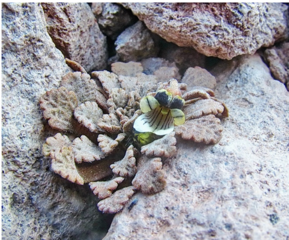
Fig. 17) Viola gelida . (Photo - 11 Dec 2011. Courtesy of M.P. Cárdenas and Cedrem)