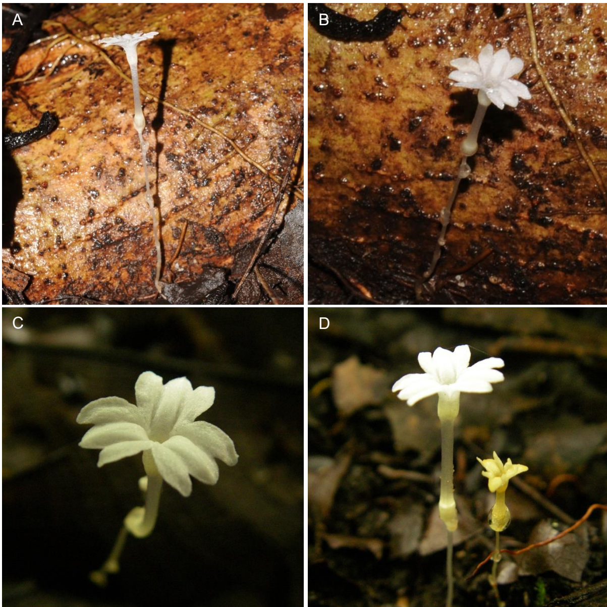
Fig. 1. Gymnosiphon fonensis . A. side view of inflorescence, note cylindrical distal portion of perianth tube. B. flower, three-quarter view; C. flower showing outer perianth lobes with equal lateral and median portions; D. Gymnosiphon fonensis (left) with Gymnosiphon samouritoureanus (right); A & B photo of Cheek 19334 (HNG, K); C & D from van der Burgt 1274 (HNG, K)

The number of species described as new to science each year regularly exceeds 2000, adding to the estimated 369 000 already known (Nic Lughadha et al. 2016; Cheek et al. 2020b). Only about 7% of plant species have been assessed and included on the redlist using the IUCN (2012) standard (Bachman et al. 2019), but this number rises to 21–26% when additional evidence-based assessments are considered, and 30–44% of these assess the species as threatened (Bachman et al. 2018).