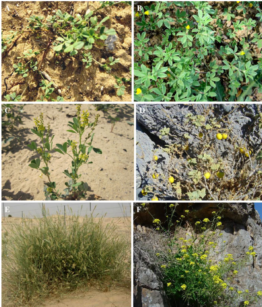
Fig. 2 Some crop wild relatives found in the Arabian Peninsula. A. Medicago laciniata , B. Lotus halophilus , C. Melilotus indica , D. Solanum incanum , E. Pennisetum divisum , F. Sinapis arvensis

or TG3 and TG4 as more remote with lower priority. Heywood et al. (2007) although suggested exclusion of the taxa in TG5 from being considered as CWRs of that particular crop, the author thinks that they should also be targeted for conservation—considering that significant advances have been made in recent years, both in molecular technologies and hybridization procedures that allow for the transfer of genes even from distinctly related taxa. Furthermore, an examination of the hybridization results between crucifer species also illustrates that gene transfer is possible between remote genera with conventional breeding techniques even without recourse to genetic engineering.