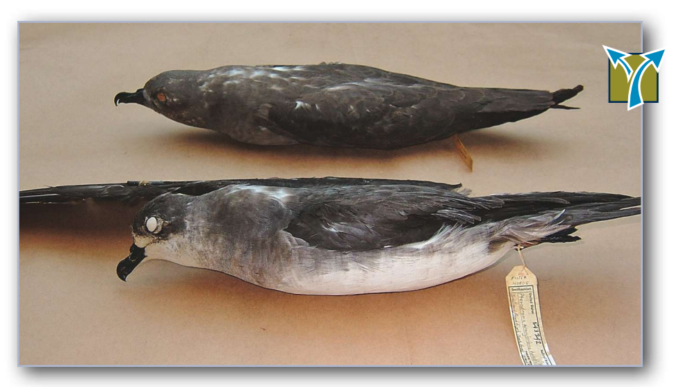
The Herald Petrel was recently spilt from the Trindade Petrel of the Atlantic, both species formerly being known as Herald Petrel. Trindade Petrel is annual in ABA Area waters, but Herald Petrel is represented in the ABA Area only by the specimen shown here and a few additional sight records. The CLC determined that it was a Herald Petrel in the strict sense based on the specimen's measurements and dark primary shafts on the upper-wing, ruling out Kermadec and Trindade petrels. Front: Light-morph Herald Petrel USNM 543342; Tern Island, French Frigate Shoals, Hawaii; March 14, 1968. Rear: Dark-morph Kermadec Petrel, USNM 300679; Kure Atoll, Hawaii; April 20, 1923.

this up to local records committees. Remarkably, five species added based on Hawaii (Table 1) have recently been recorded in the Continental ABA Area and have been accepted by or are in review by local committees: Nazca Booby (multiple records from California in 2013–2017 and Alaska in September