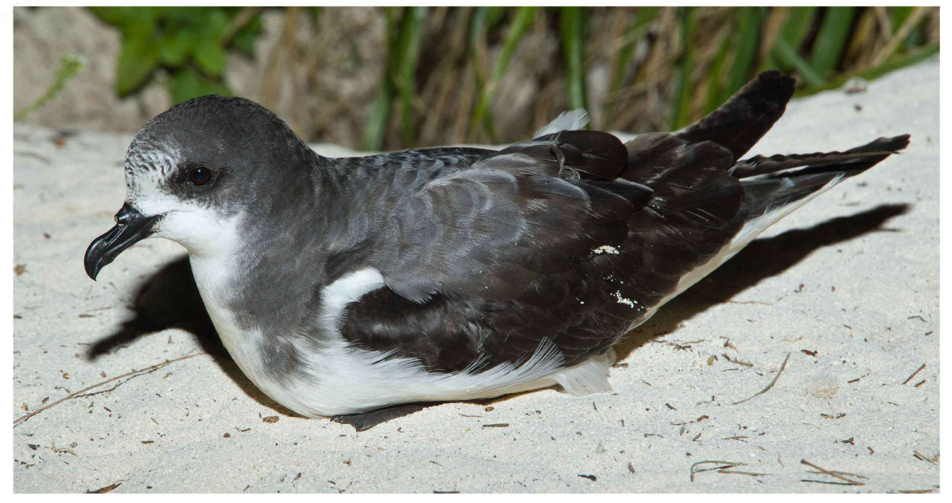
\textbf{Bonin Petrel} \ (\textit{Pterodroma hypoleuca}), \ ABA \ Code \ 3.