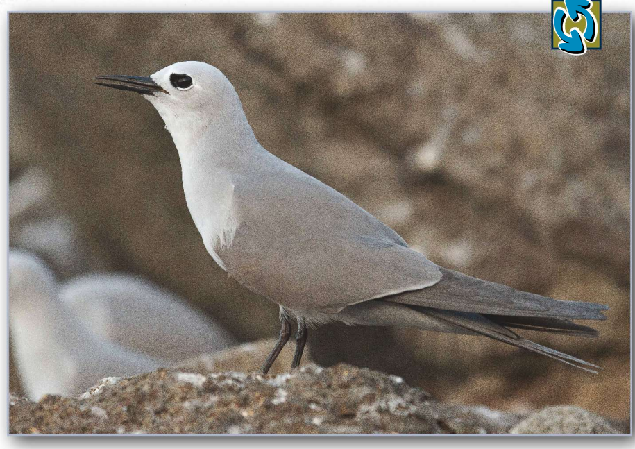
The Blue-gray Noddy was recently placed by the AOS with other noddies in the genus Anous ; the species-level taxonomy of this group is in need of revision. Seeing this species in the ABA Area will require a boat trip to some of the more remote of the Northwestern Hawaiian Islands. Nihoa, Hawaii; September 14, 2013.