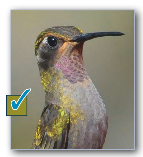
Remarkably, this Amethyst Hummingbird provided the second record of this species in the ABA Area within a three-month span, the first being from Quebec about 10 weeks earlier (Denault et al. 2017). Both are firstfall males (by the dull rose throat and worn brown wings), but careful comparison of plumage details indicates them to be separate individuals. Davis Mountains, Texas; October 14, 2016. Photo by © Kelly Bryan .

of the distinctions between ABA Codes 1 and 2 is that Code 2 birds have a more restricted range within the ABA Area. Based on this scheme, the lowest ABA code assigned for Hawaii additions is Code 2, representing species easily observed in Hawaii but not elsewhere in the ABA Area. Sadly, 33 Code 6 birds are listed in Table 1, increasing the number of these in the ABA Area from 10 to 43. The addition of Hawaii to the ABA Area also results in the reassignment of ABA codes for 13 species based on their more-common status in Hawaii than in the Continental ABA Area. These are: Black Noddy (from 3 to 2), White-tailed Tropicbird (3 to 2), Red-tailed Tropicbird (4 to 3), Bulwer's Petrel (5 to 3), Wedge-tailed Shearwater (4 to 2), Newell's Shearwater (5 to 3), Tristram's Storm-Petrel (5 to 3), Great Frigatebird (5 to 3), Lesser Frigatebird (5 to 4), Brown Booby (3 to 2), Red-footed Booby (4 to 2), Eurasian Skylark (3 to 2), and Yellow-faced Grassquit (4 to 3).