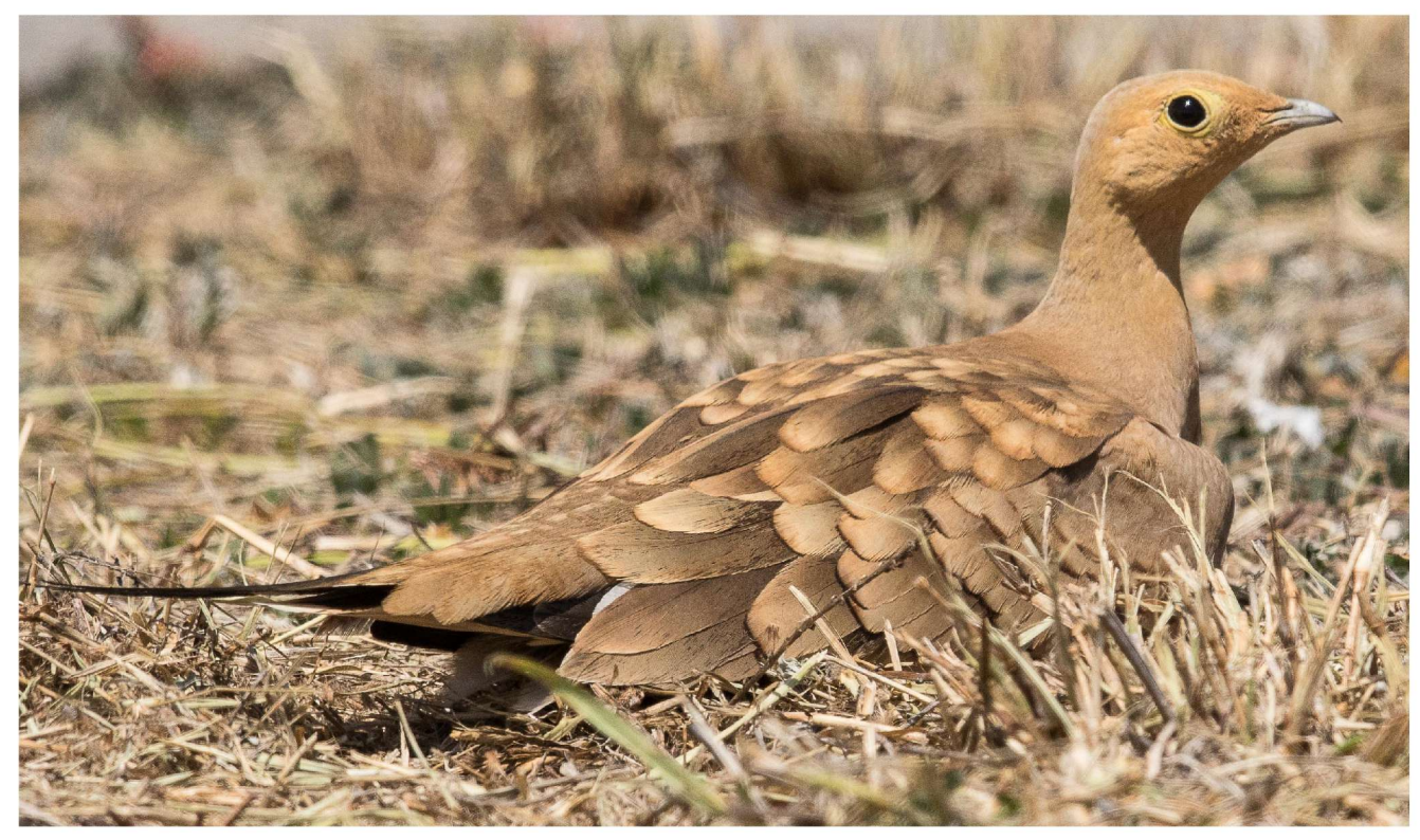
Chestnut-bellied Sandgrouse (Pterocles exustus), ABA Code 3.