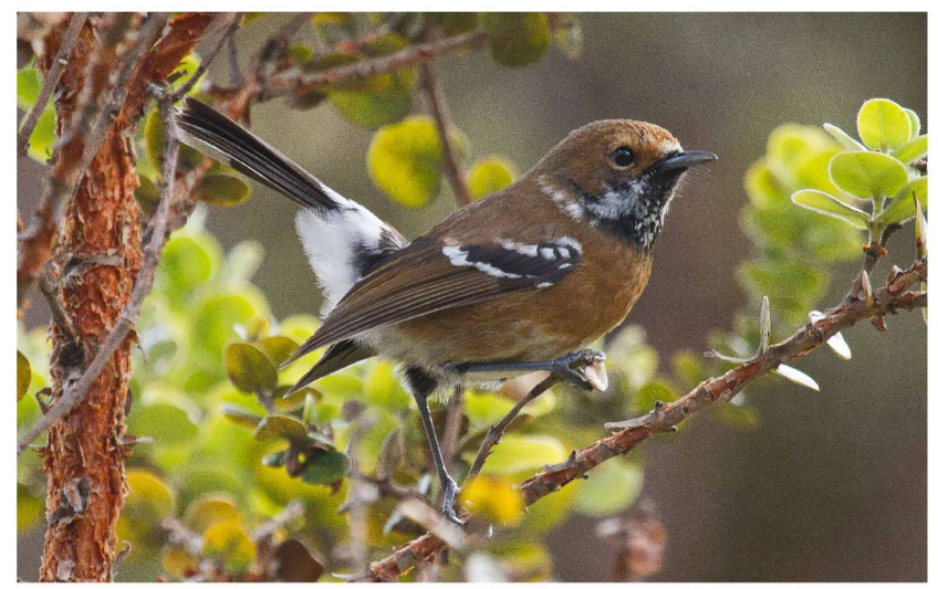
Hawaii Elepaio ( Chasiempis sandwichensis ), ABA Code 2.