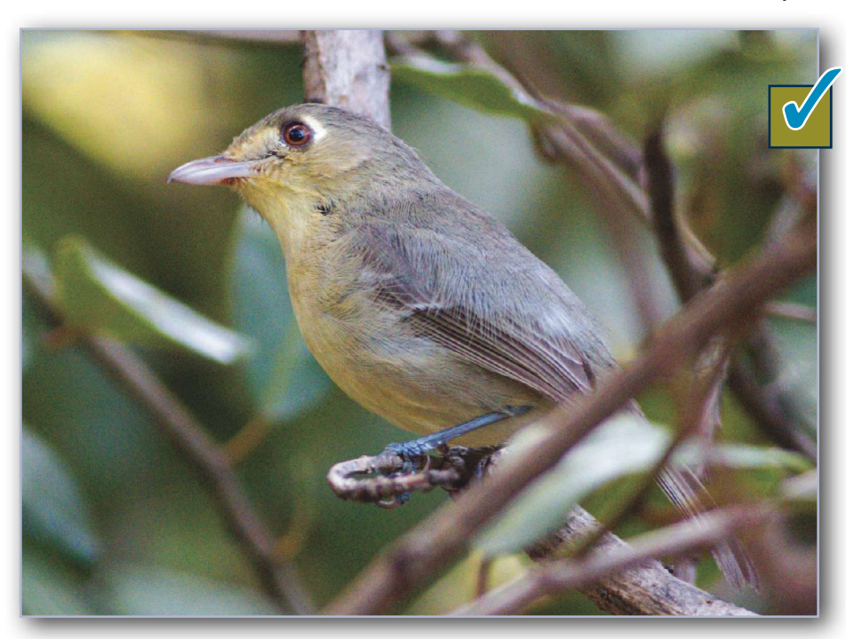
The CLC accepted Cuban Vireo on the basis of good photos from the Florida Keys in April 2016. This distinctive species was found again at the same location a year later, fueling speculation that a returning or long-staying individual was involved. Key West, Monroe County, Florida; April 22, 2016.

Cuban Vireo (Vireo gundlachii)—ABA CLC Record #2016–04. A first-year