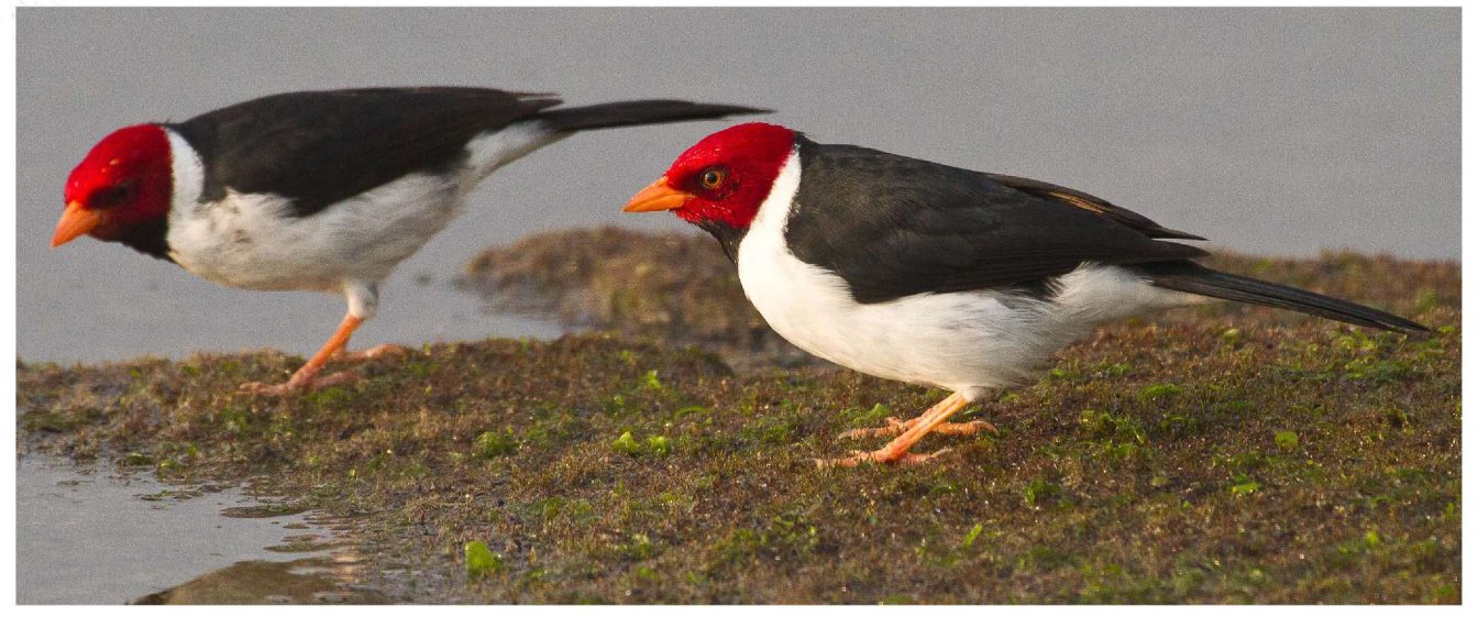
\textbf{Yellow-billed Cardinal} \ (\textit{Paroaria capitata}), \ ABA \ Code \ 2. \ \textit{Photo by} \ @ \ \textit{Eric VanderWerf}.