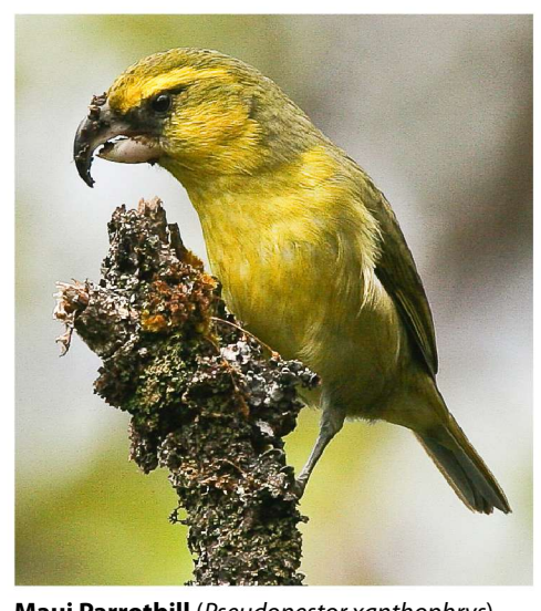
Maui Parrotbill ( Pseudonestor xanthophrys ), ABA Code 3.