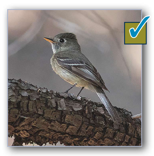
The much narrower bill and whip call note helped separate this Pine Flycatcher from the otherwise similar Cordilleran Flycatcher—which species it may have paired with. Santa Rita Mountains, Pima County, Arizona; May 30, 2016.