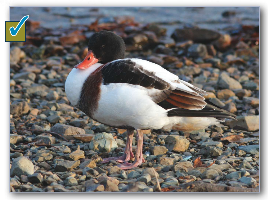
Shown here is one of two Common Shelducks accepted by the ABA CLC as a naturally occurring vagrant to the ABA Area. The species may well prove to be a regular vagrant to eastern North America, following in the webbed footsteps of Pink-footed and Barnacle geese. St John's, Newfoundland; November 17, 2009.